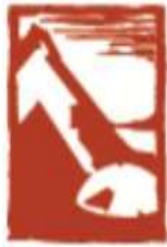
Exhibit K – Loan