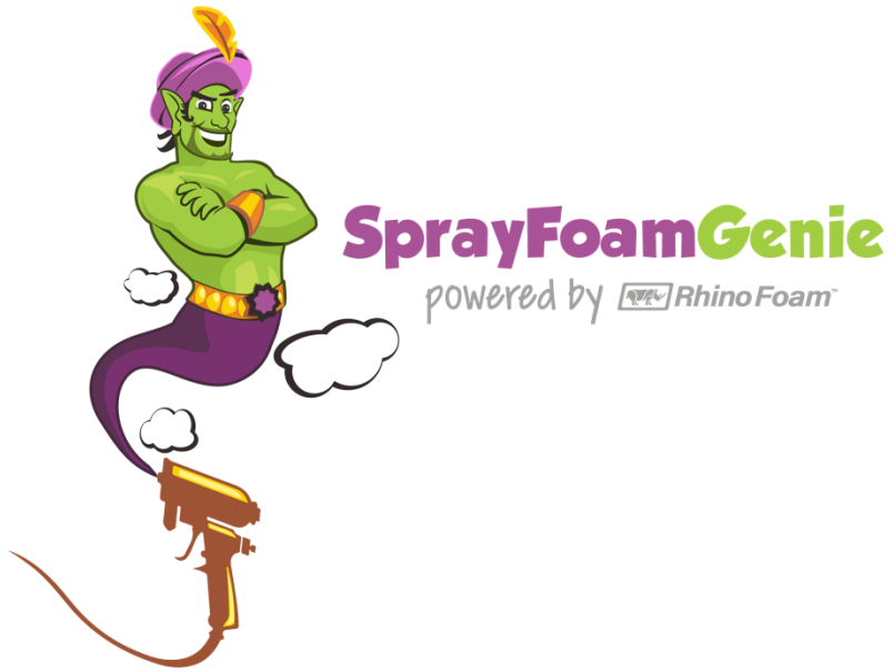
EXHIBIT A. FRANCHISE AGREEMENT

TO THE SPRAY FOAM GENIE FRANCHISE DISCLOSURE DOCUMENT