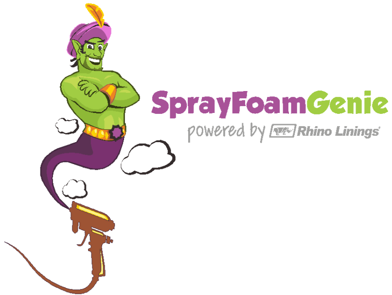
EXHIBIT I. TABLES OF CONTENTS OF OPERATING MANUAL TO THE SPRAY FOAM GENIE FRANCHISE DISCLOSURE DOCUMENT