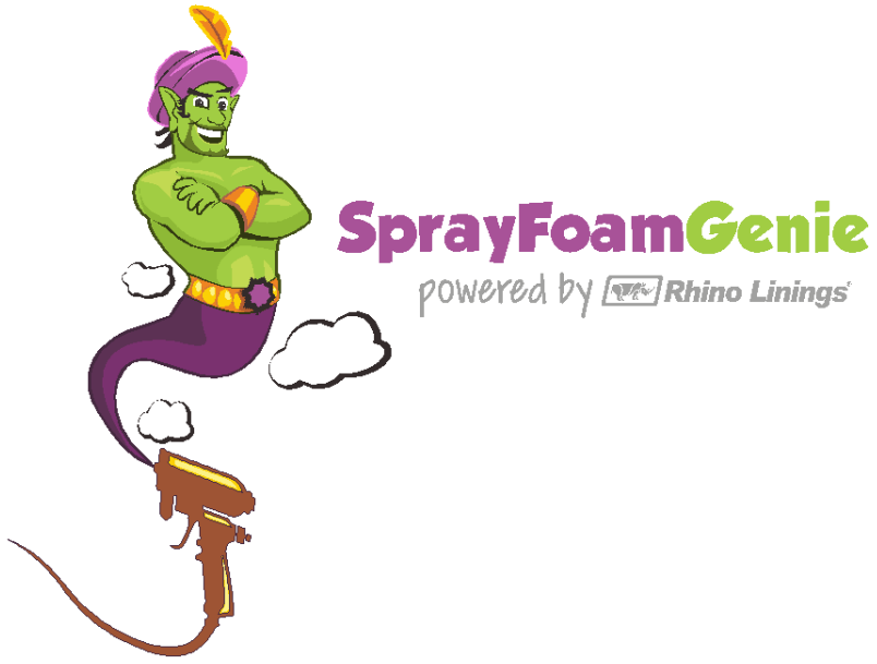
EXHIBIT F. LIST OF FRANCHISEES

TO THE SPRAY FOAM GENIE FRANCHISE DISCLOSURE DOCUMENT