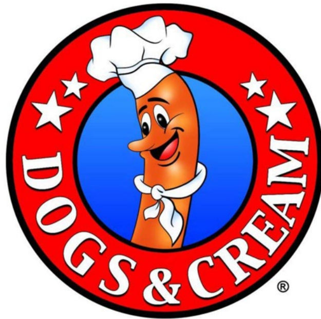
EXHIBIT G. LIST OF FRANCHISEES

TO THE DOGS & CREAM FRANCHISE DISCLOSURE DOCUMENT