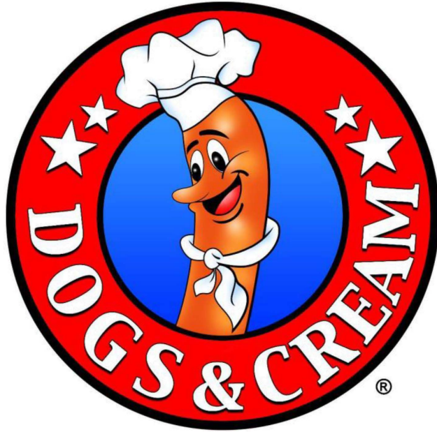
EXHIBIT A. FRANCHISE AGREEMENT

TO THE DOGS & CREAM FRANCHISE DISCLOSURE DOCUMENT