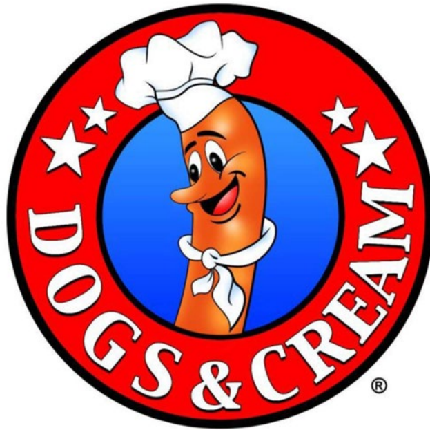
EXHIBIT D. RESTRICTIVE COVENANT AGREEMENT

TO THE DOGS & CREAM FRANCHISE DISCLOSURE DOCUMENT