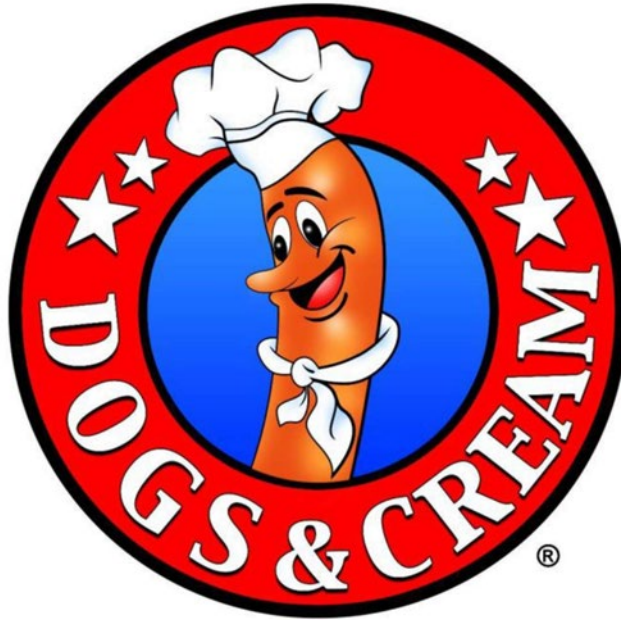
EXHIBIT H. LIST OF FRANCHISEES THAT LEFT THE SYSTEM TO THE DOGS & CREAM FRANCHISE DISCLOSURE DOCUMENT