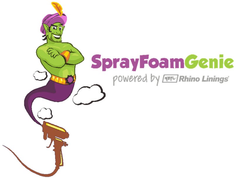
EXHIBIT J. STATE SPECIFIC ADDENDUMS

TO THE SPRAY FOAM GENIE FRANCHISE DISCLOSURE DOCUMENT