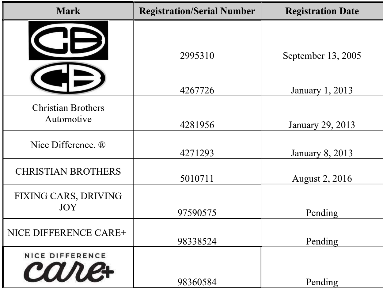
EXHIBIT "B" TO FRANCHISE AGREEMENT THE MARKS