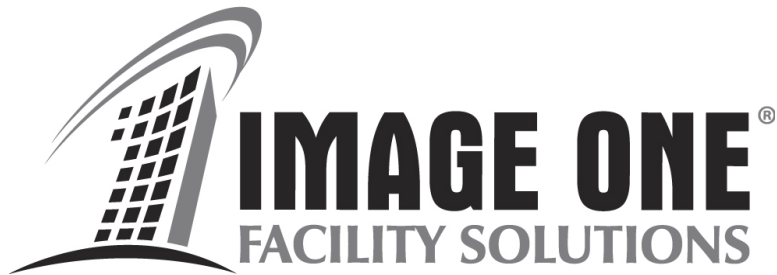
Image One Facility Solutions, Inc. 3601 Algonquin Road, Suite 100 Rolling Meadows, IL 60008 (630) 616-1010