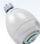
1.5 GPM Low-flow Shower Head