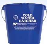
Cold Water Catcher Bucket