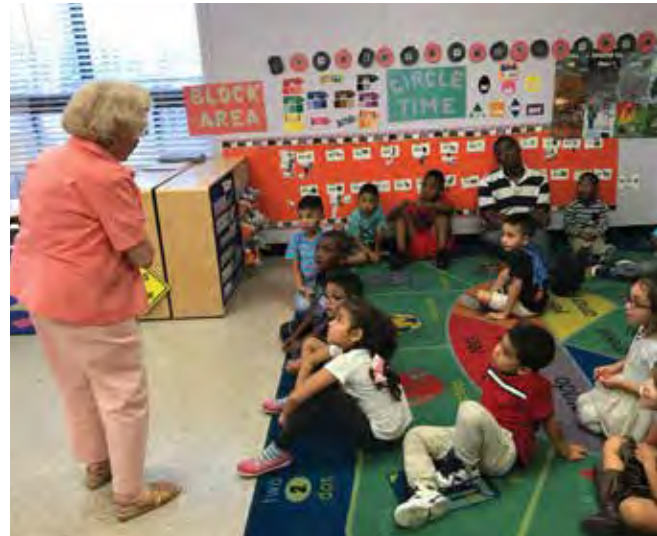
^ WESTMINSTER RESIDENTS VOLUNTEERING AND READING TO HEAD START KIDS