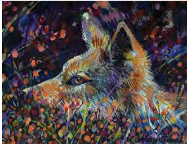
^ MIXED MEDIA, 3RD PLACE: NANCY SIMONS, SURVIVOR