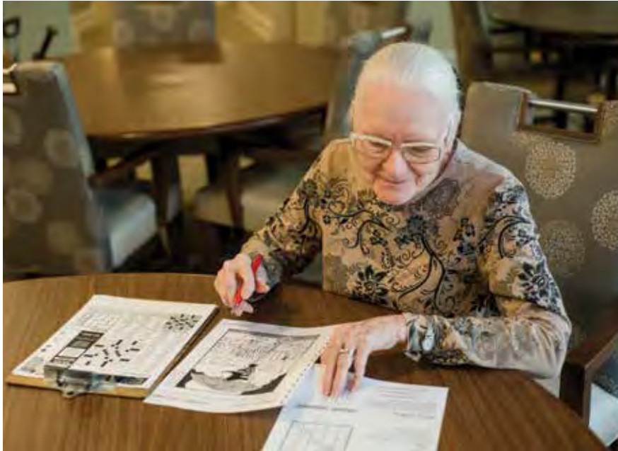
◀ ♡ BRAIN WORKOUTS AND DIGITAL DEVICES HELP KEEP MINDS ACTIVE AND SHARP