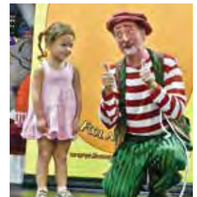
CLOCKWISE FROM TOP RIGHT: GRANDPARENTS DAY; CLOWNING AROUND; HELICOPTER RIDE; LUNCH AT GRAPE CREEK VINEYARD; THE AUSTIN CIVIC WIND ENSEMBLE PLAYS AT WESTMINSTER