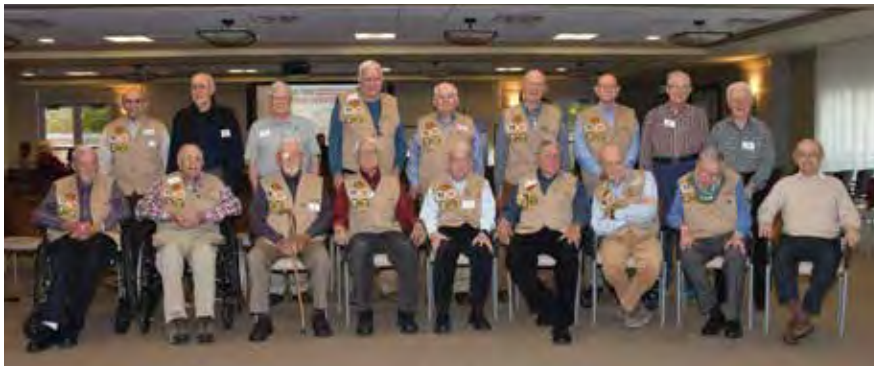
^ WESTMINSTER'S VETERANS CORPS MEET REGULARLY