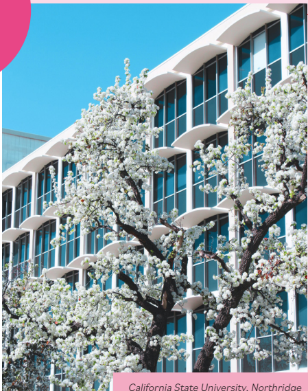
California State University, Northridge