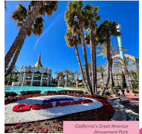
California's Great America Amusement Park