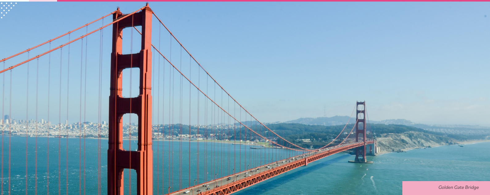
Golden Gate Bridge