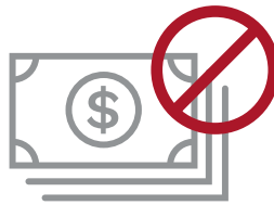
Diffusers add cost to the mirror