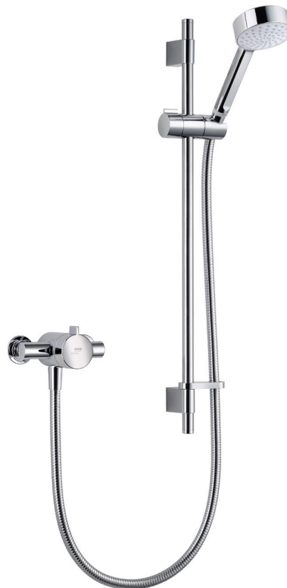
Mira Minilite EV

Single spray 9cm showerhead with rub-clean nozzles (except BIR which has a large 200mm deluge showerhead)