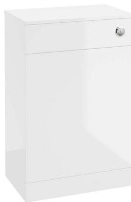
Gloss White: UF2179