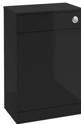
Gloss Black: UF2180