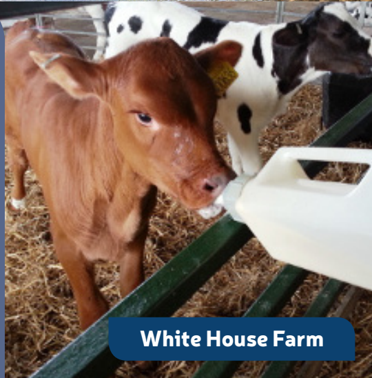
White House Farm