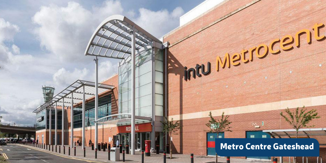
Metro Centre Gateshead