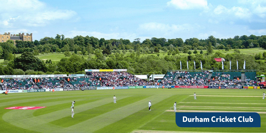
Durham Cricket Club