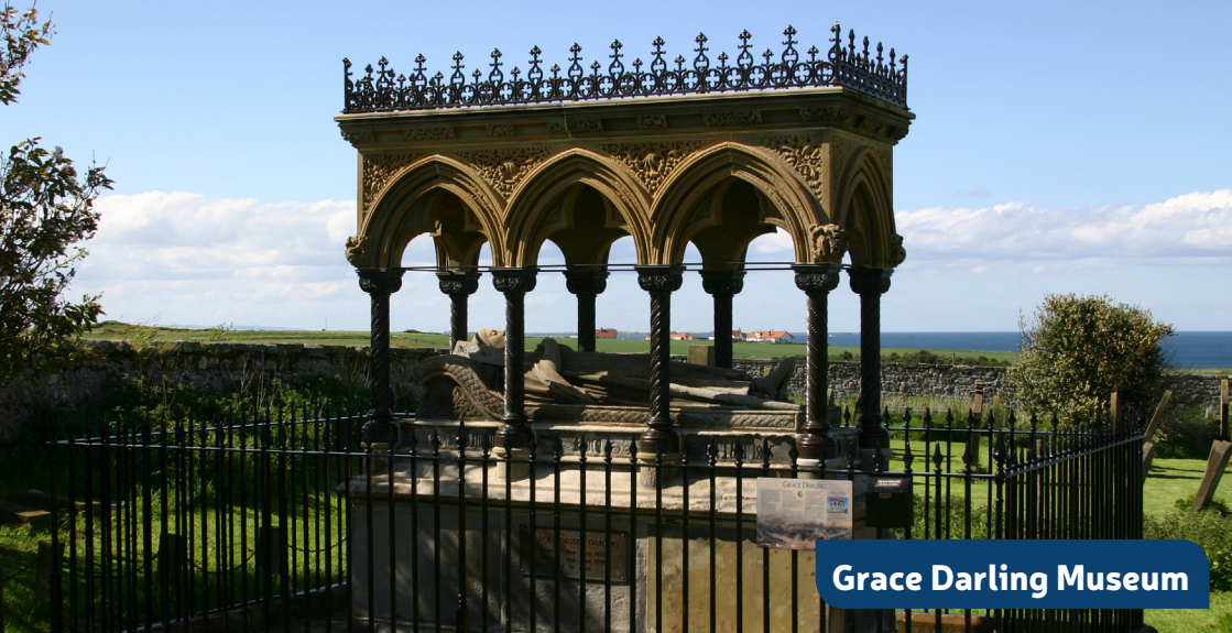
Grace Darling Museum