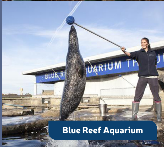
Blue Reef Aquarium