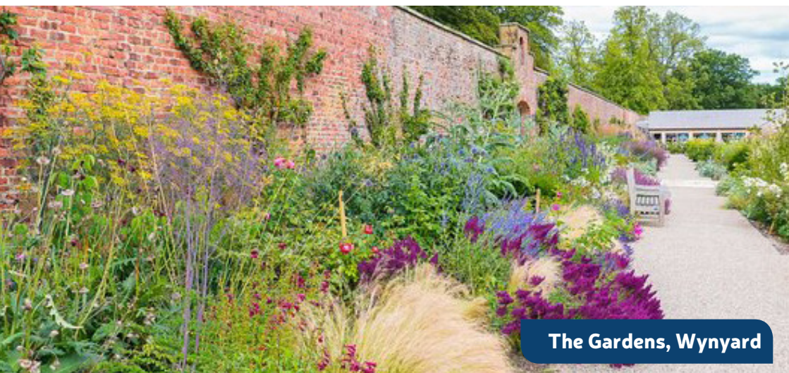
The Gardens, Wynyard

The Gardens at Wynyard Hall are fast becoming one of the North's leading visitor attractions. They have been accredited in Visit England's Attraction Quality Scheme. Admission includes entry to the Walled Garden, Marquee and Edible Gardens, plus the farm shop, café and glasshouse.