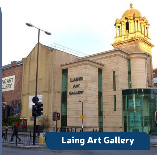
Laing Art Gallery