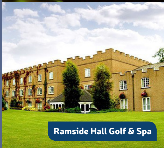
Ramside Hall Golf & Spa