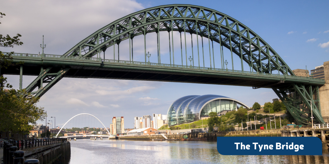
The Tyne Bridge