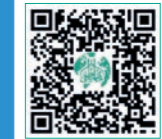
Eye Hospital Lahore