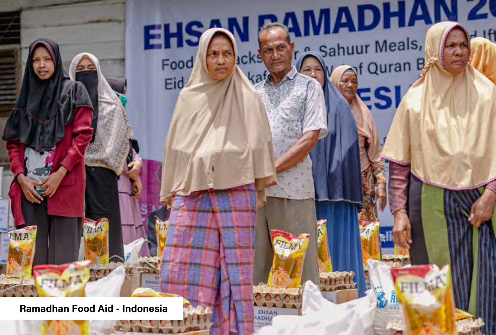
Ramadhan Food Aid - Indonesia