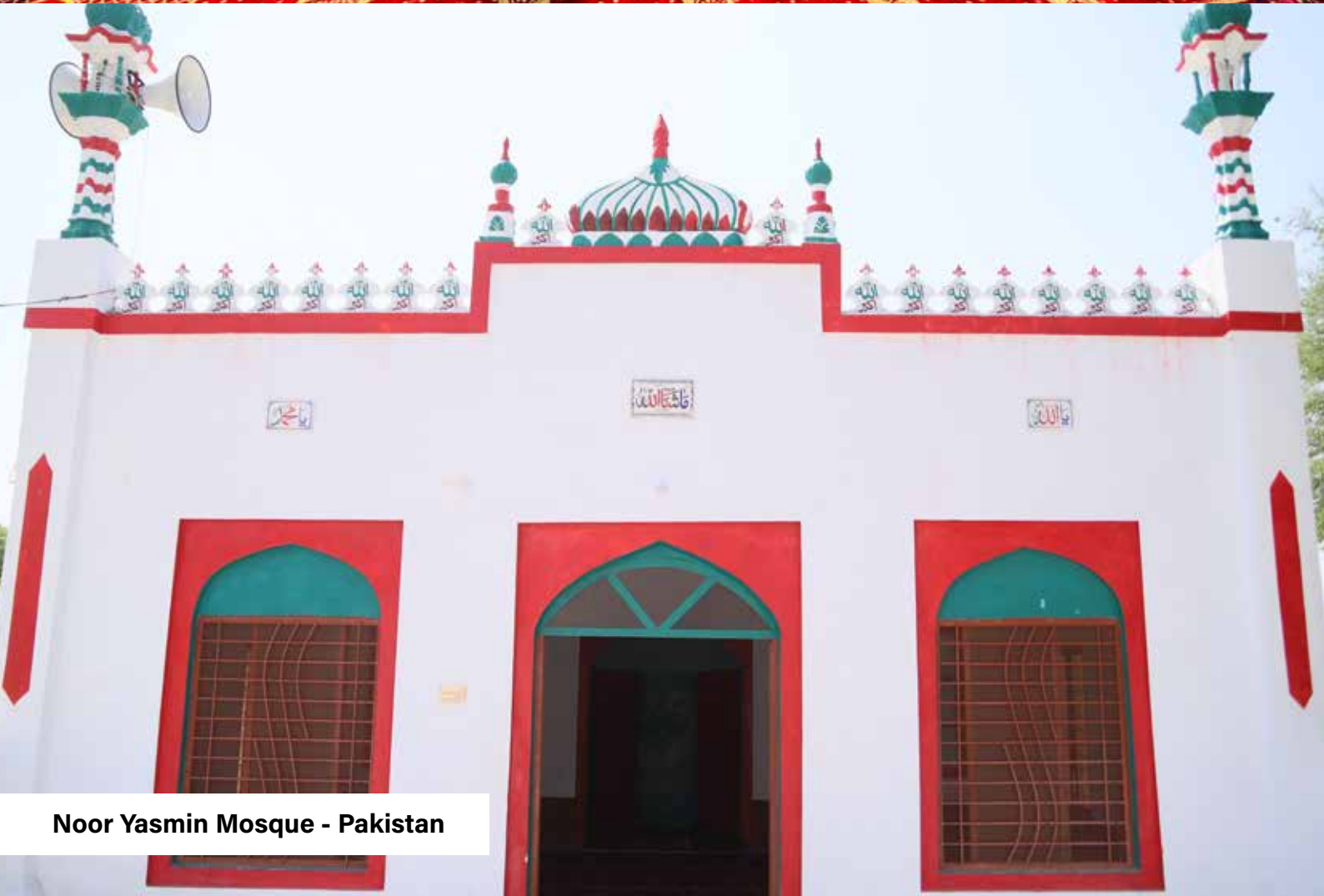
Noor Yasmin Mosque - Pakistan