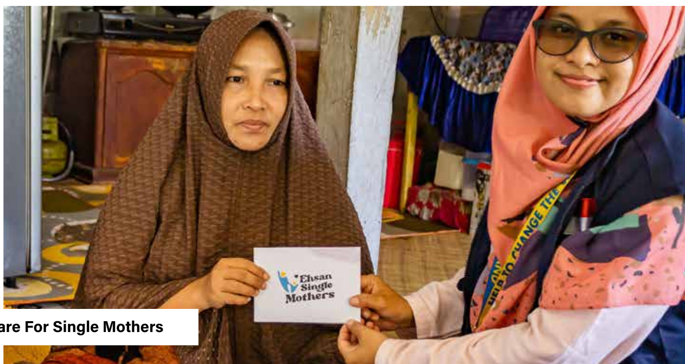
Care For Single Mothers