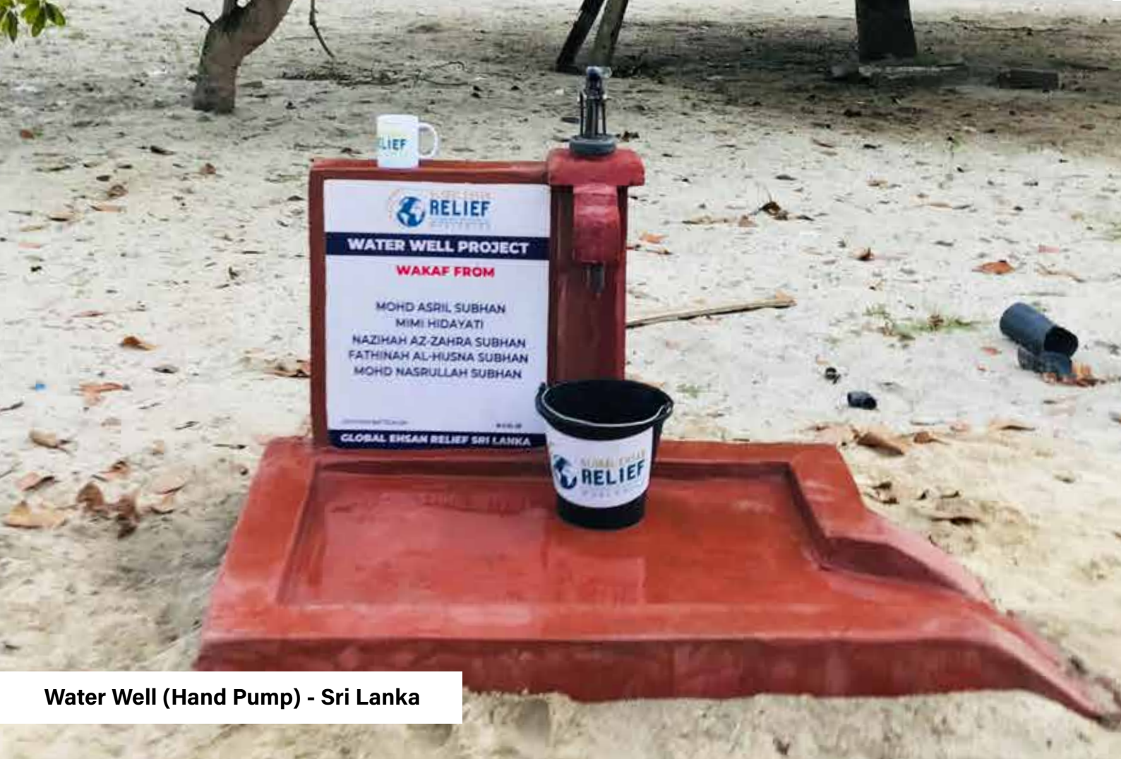
Water Well (Hand Pump) - Sri Lanka