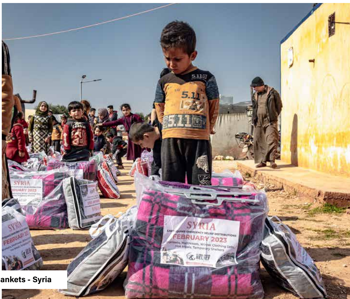
Blankets - Syria

We worked with partners on the ground to supply emergency aid in 3 phases to the survivors, helping them through the long process of recovery and rebuilding. In the immediate aftermath, we distributed urgent needs such as hot meals, winter clothes, blankets, and shelters to protect them from the harsh winter. Our second phase included more items needed to sustain the survivors as rebuilding efforts continued. We gave out hot meals, winter clothing, blankets, and other essentials during the first phase of distributions.