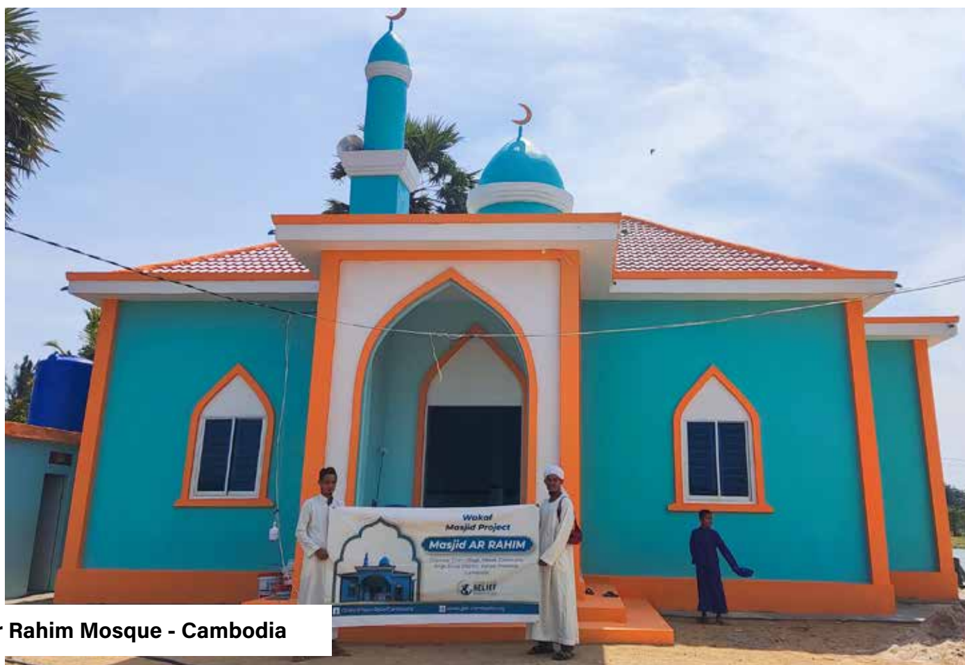
Ar Rahim Mosque - Cambodia