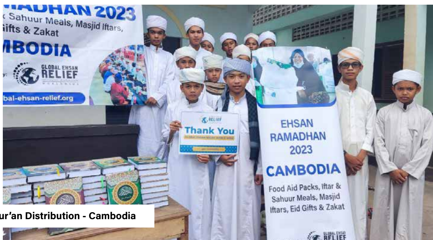
Qur'an Distribution - Cambodia