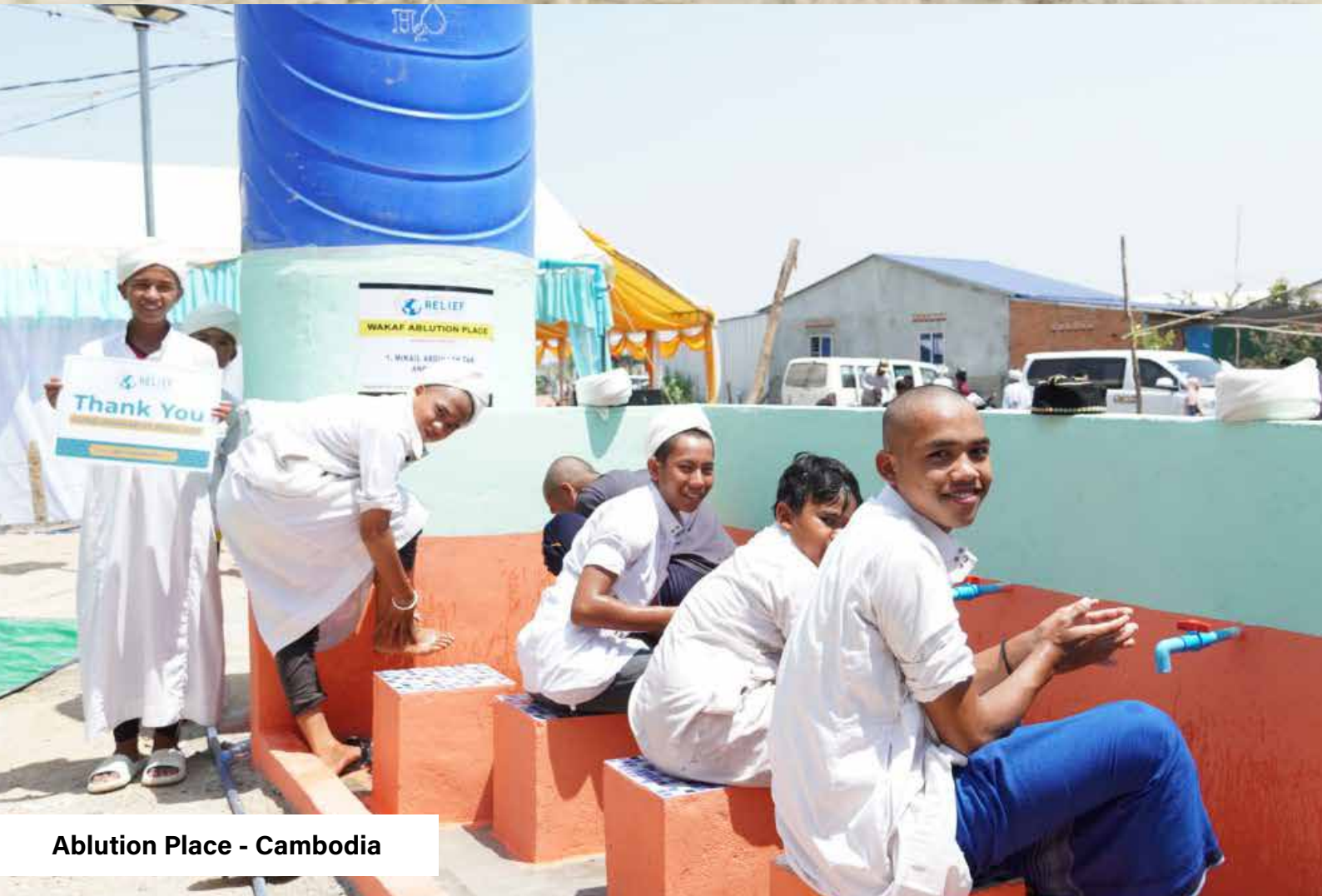
Ablution Place - Cambodia