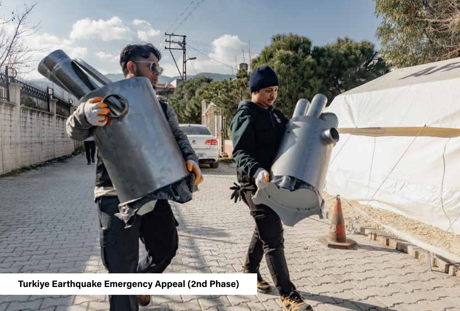
Turkiye Earthquake Emergency Appeal (2nd Phase)