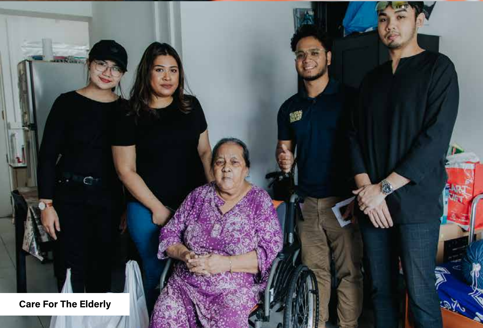
Care For The Elderly