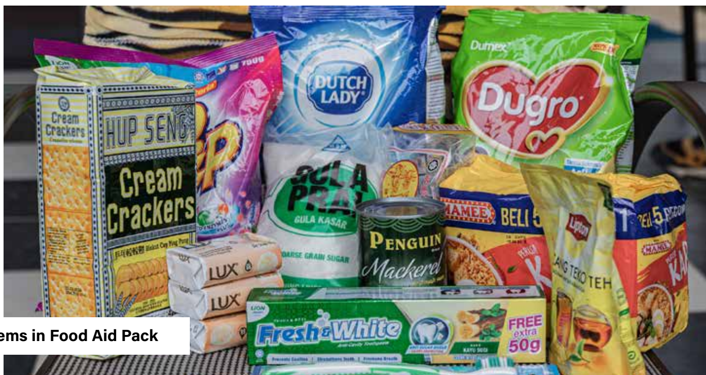
Items in Food Aid Pack