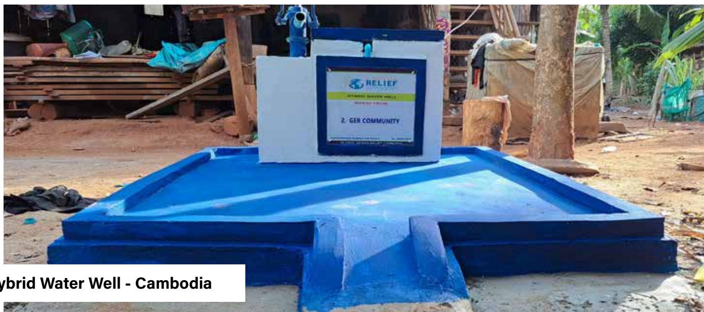
Hybrid Water Well - Cambodia