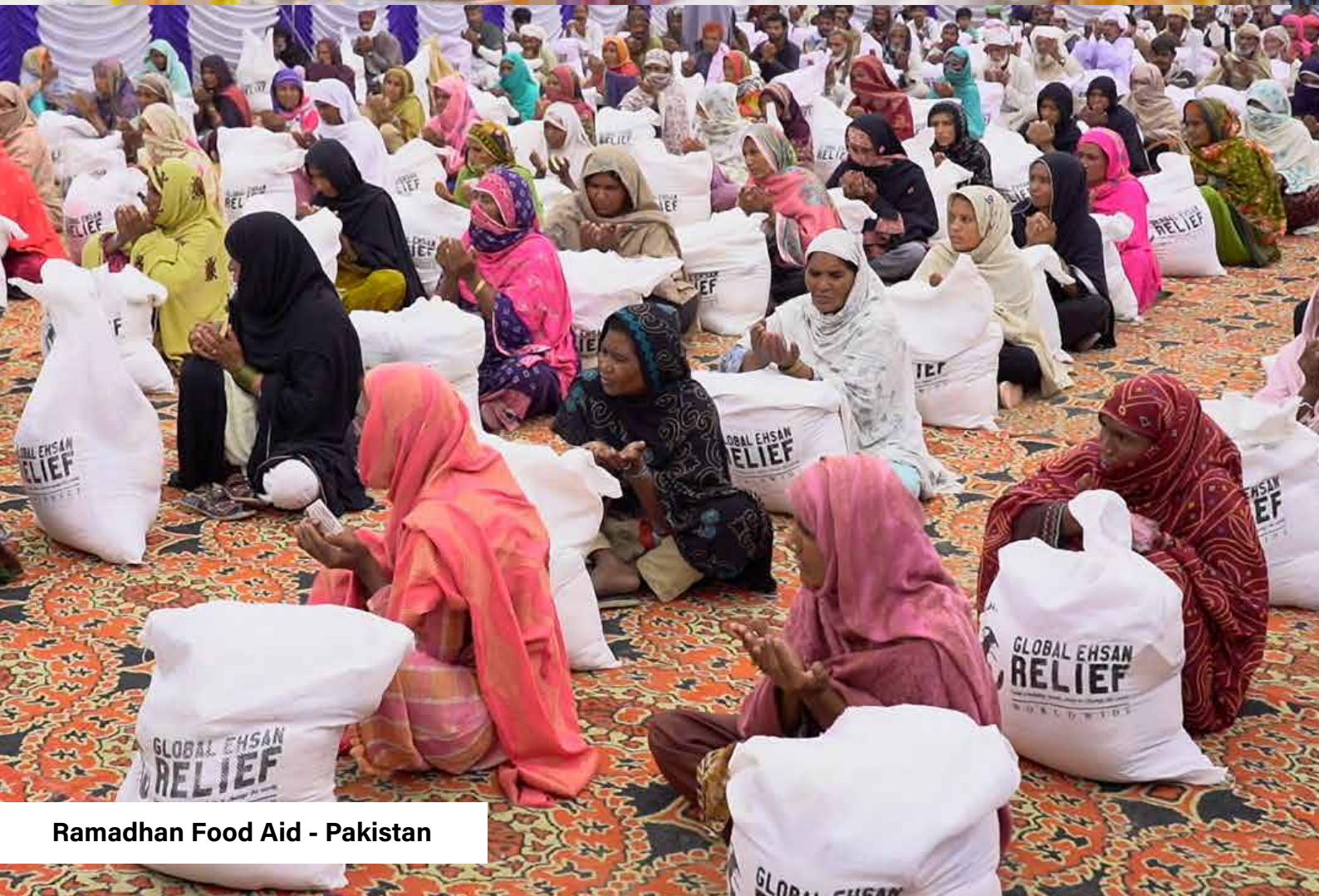
Ramadhan Food Aid - Pakistan