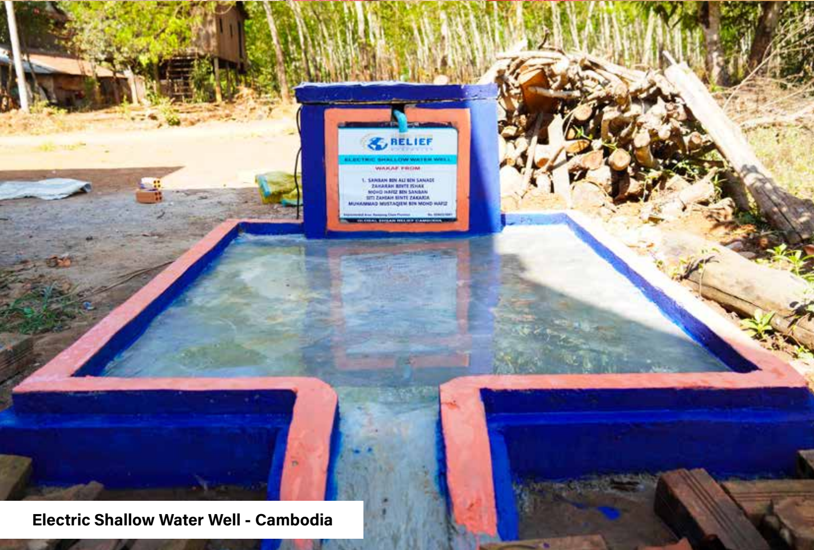
Electric Shallow Water Well - Cambodia