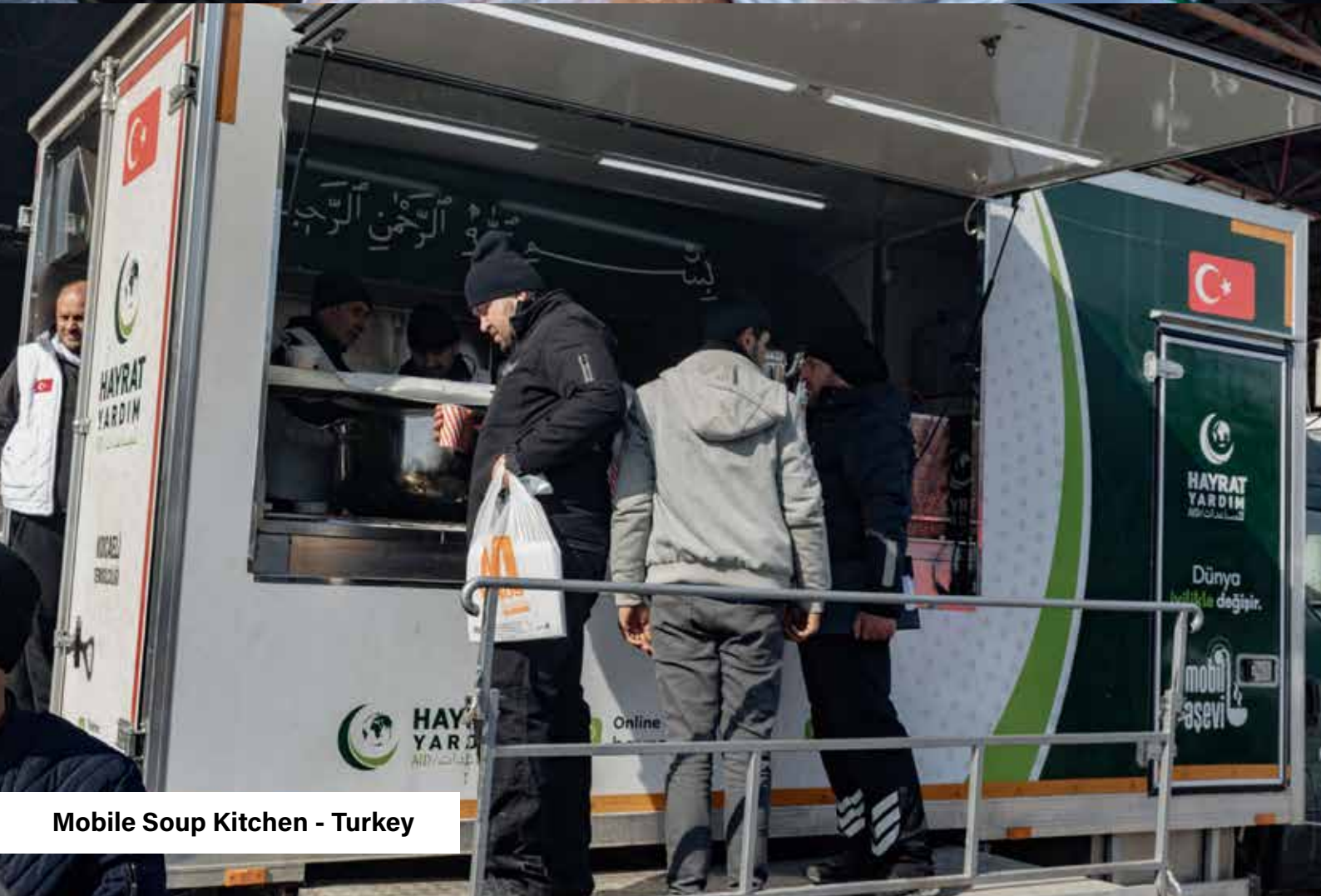
Mobile Soup Kitchen - Turkey