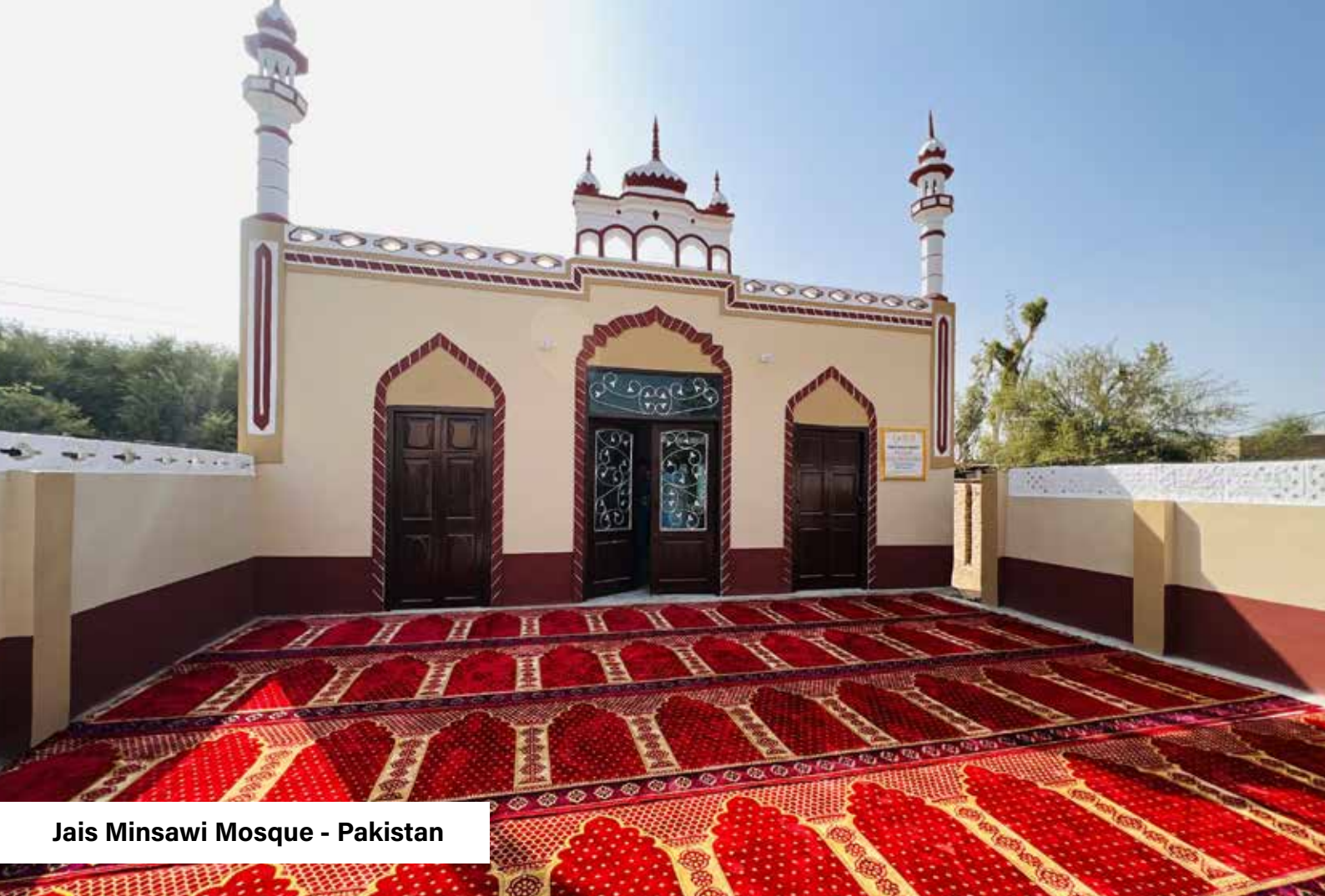
Jais Minsawi Mosque - Pakistan