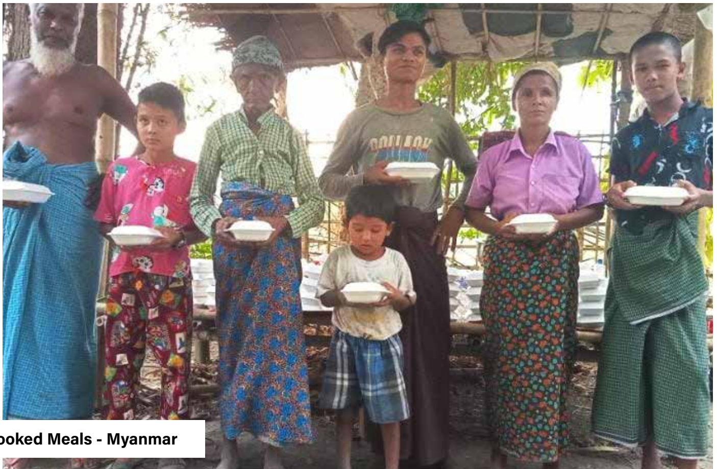
Cooked Meals - Myanmar