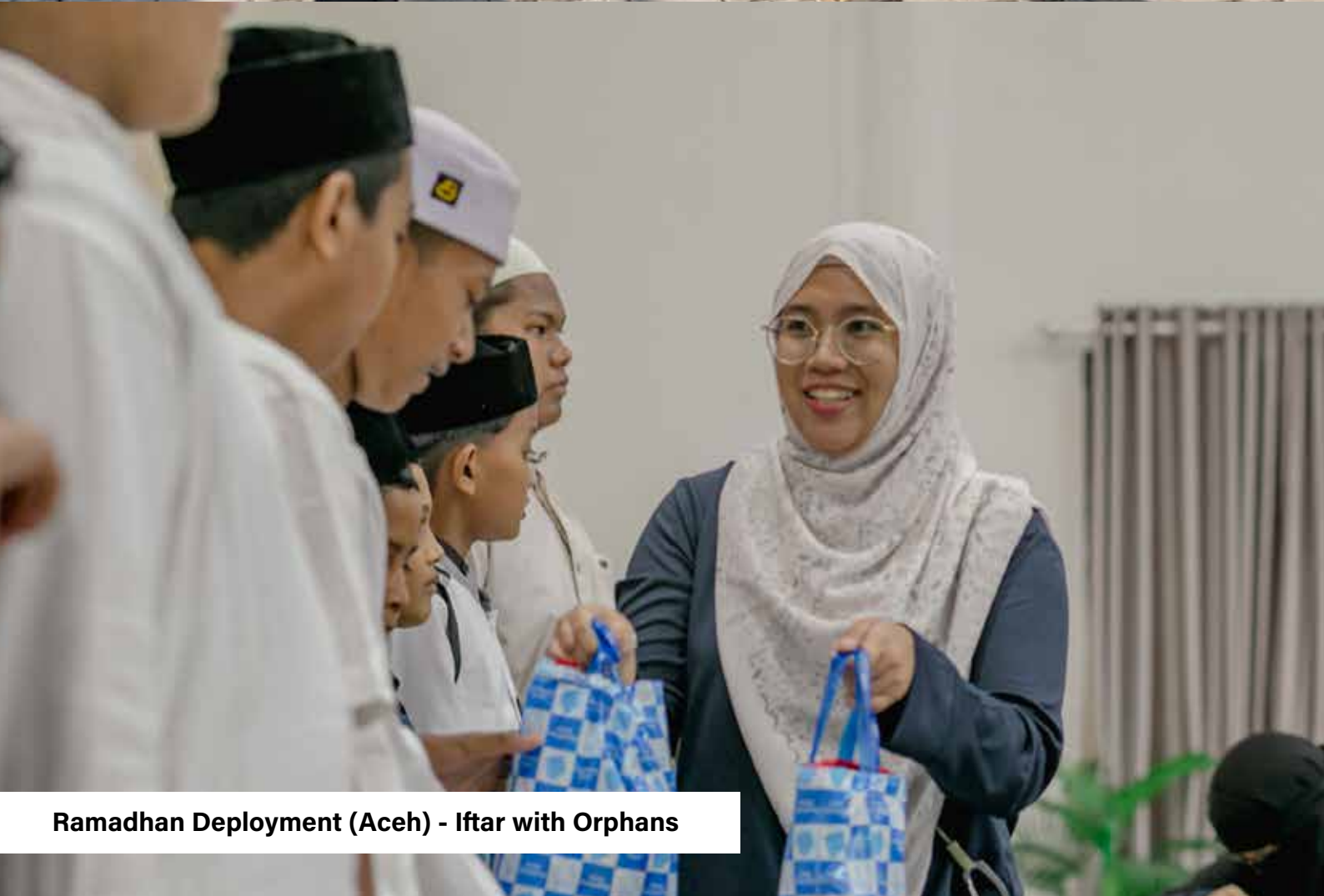
Ramadhan Deployment (Aceh) - Iftar with Orphans