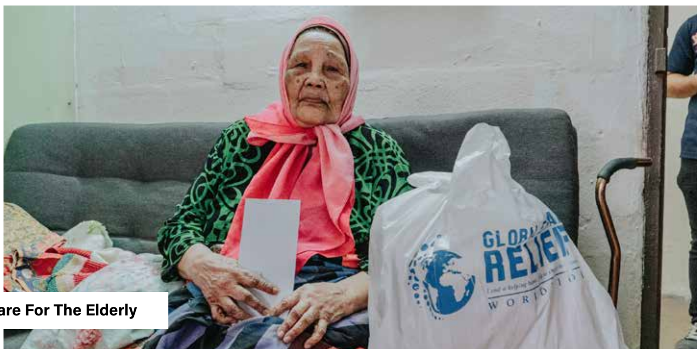
Care For The Elderly