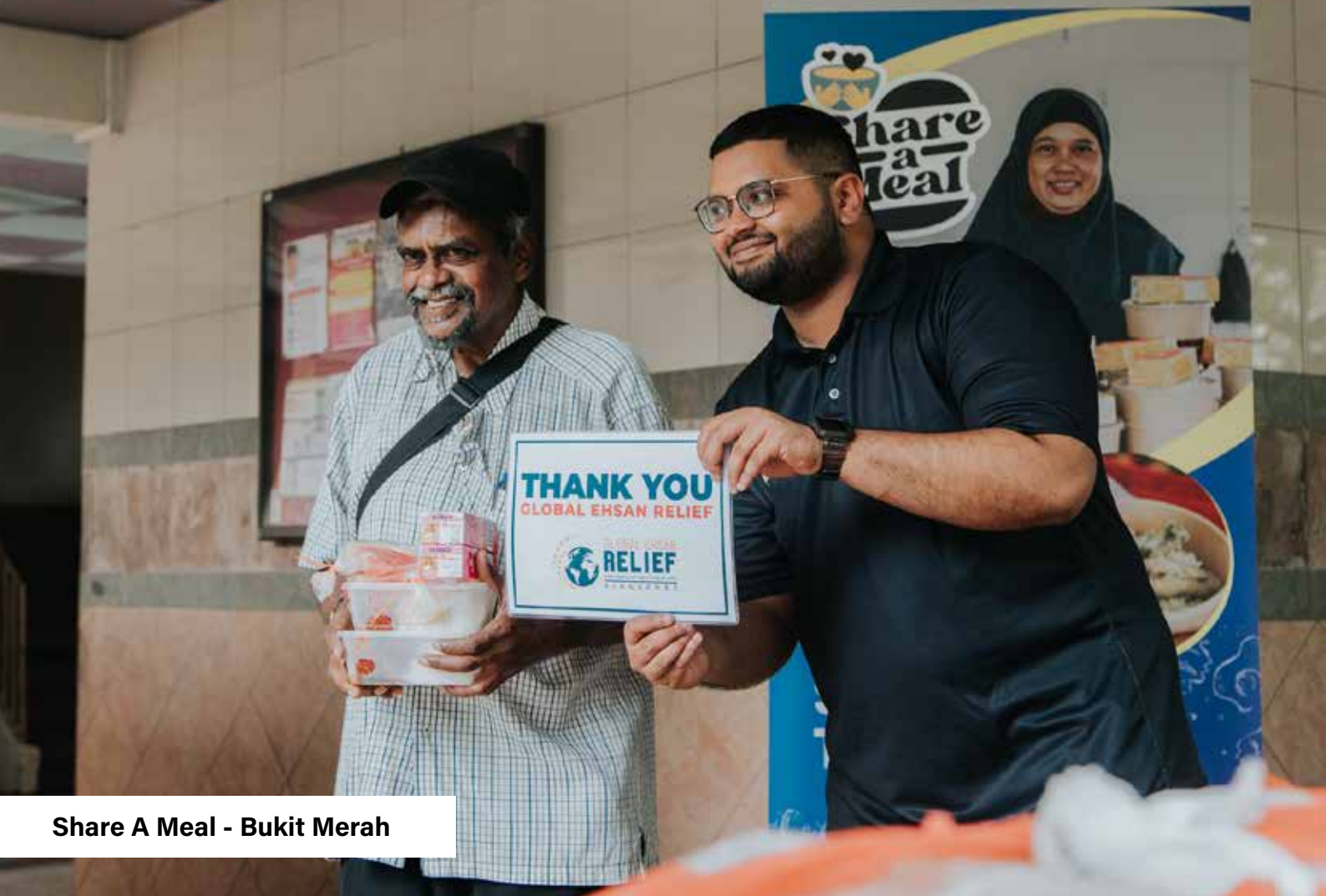
Share A Meal - Bukit Merah