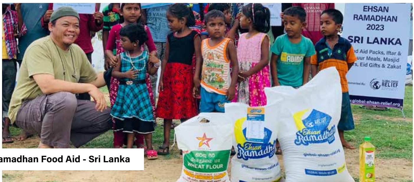
Ramadhan Food Aid - Sri Lanka