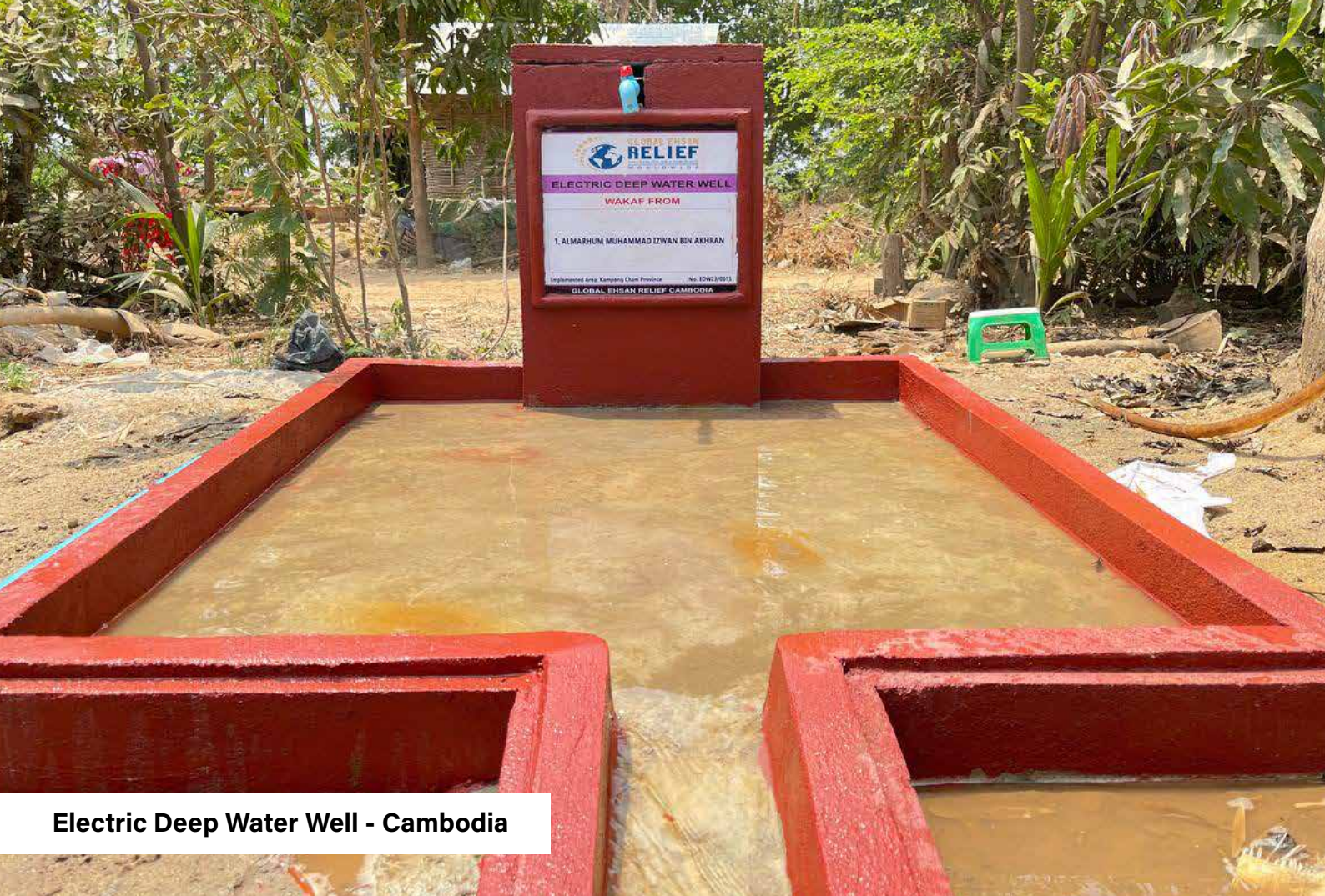
Electric Deep Water Well - Cambodia