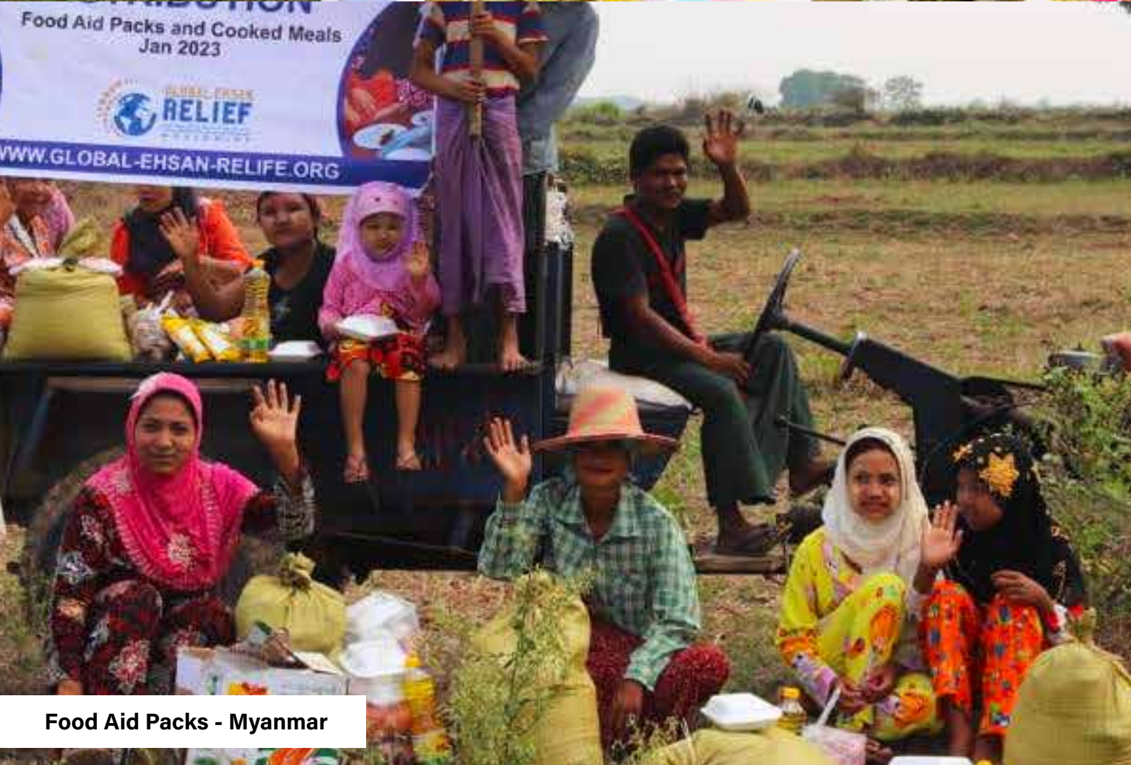
Food Aid Packs - Myanmar