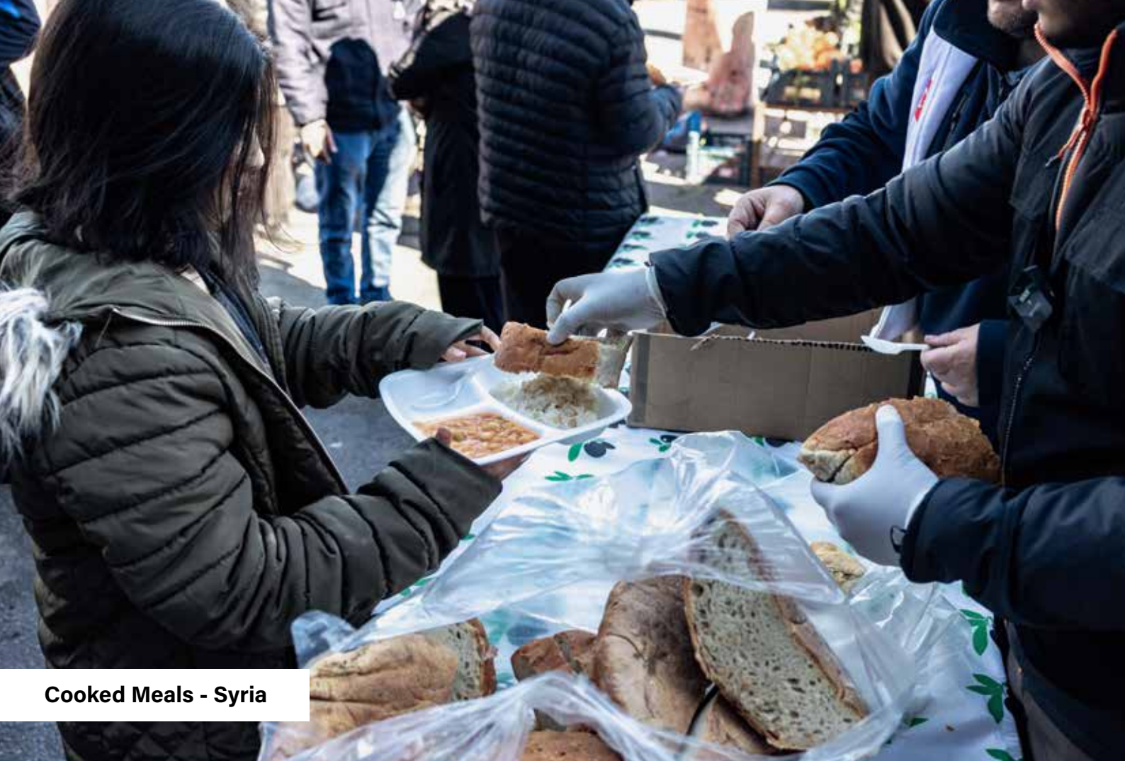
Cooked Meals - Syria