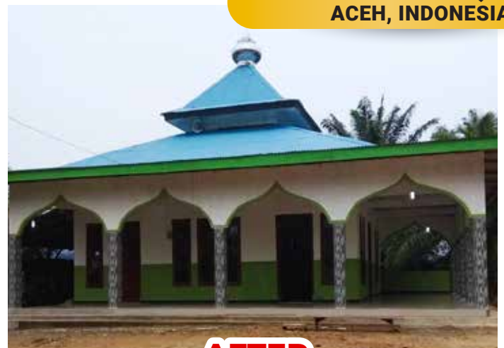
SUMBER MUKTI MOSQUE ACEH, INDONESIA