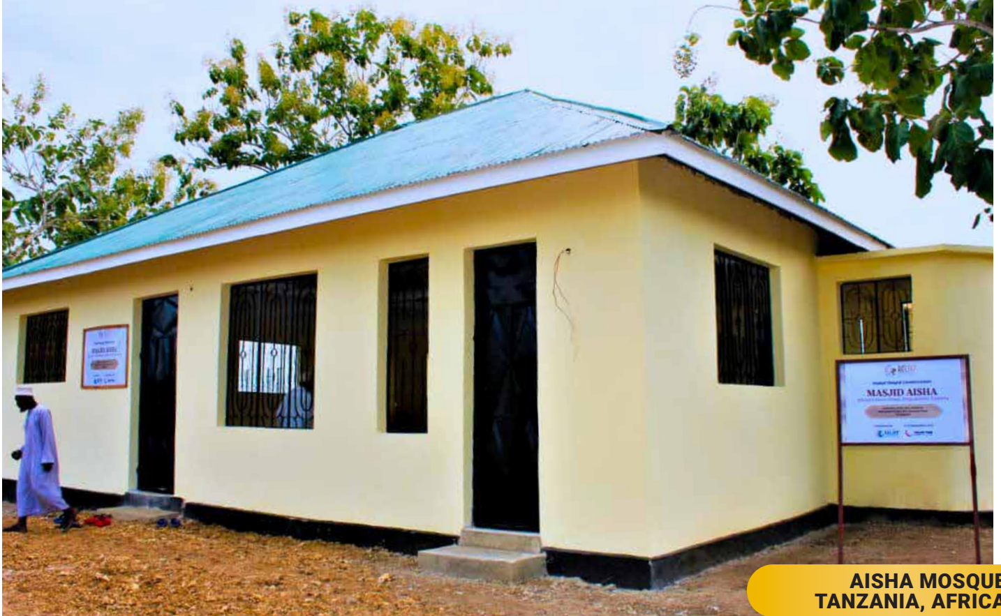
AISHA MOSQUE TANZANIA, AFRICA

In underdeveloped or poverty-stricken countries in Asia and Africa, there is often a lack of facilities and amenities that would be useful to its citizens. There is widespread hunger, they have little to no access to clean water, and there is an absence of schools. Left without any means to tackle these situations, they hope for the kindness of international donors who can improve their lives.