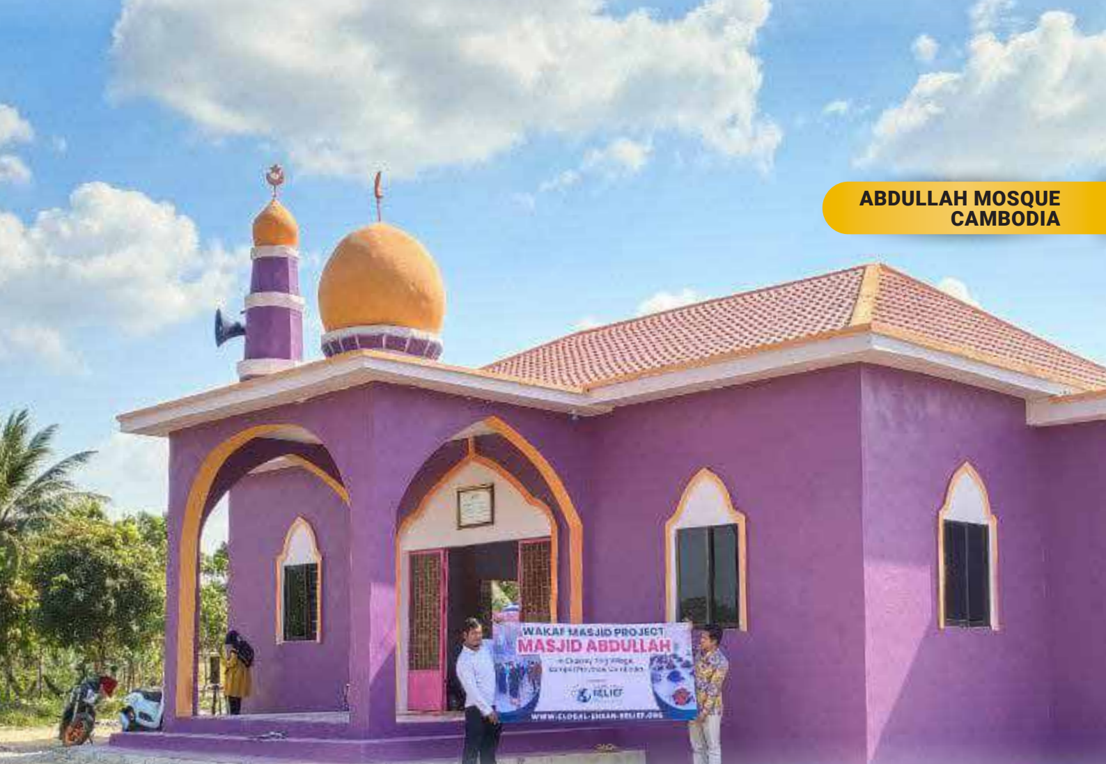
ABDULLAH MOSQUE CAMBODIA