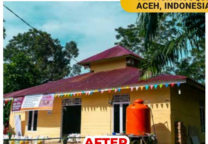
AN-NUR MOSQUE ACEH, INDONESIA