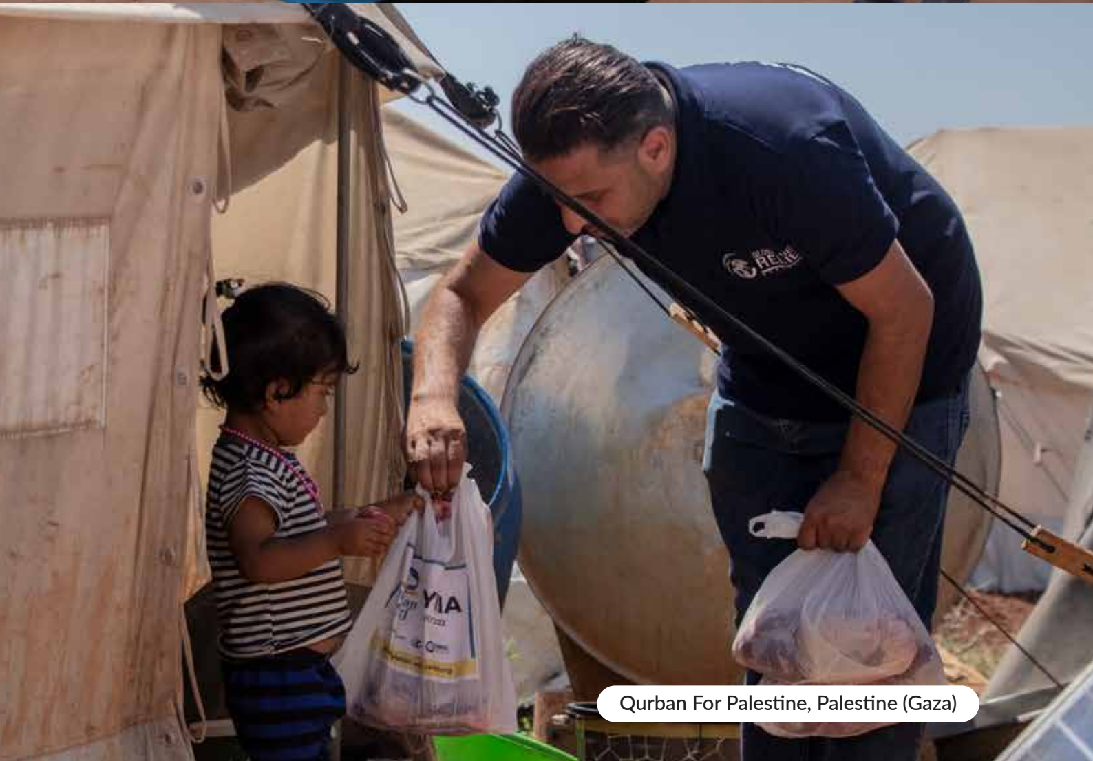
Qurban For Palestine, Palestine (Gaza)