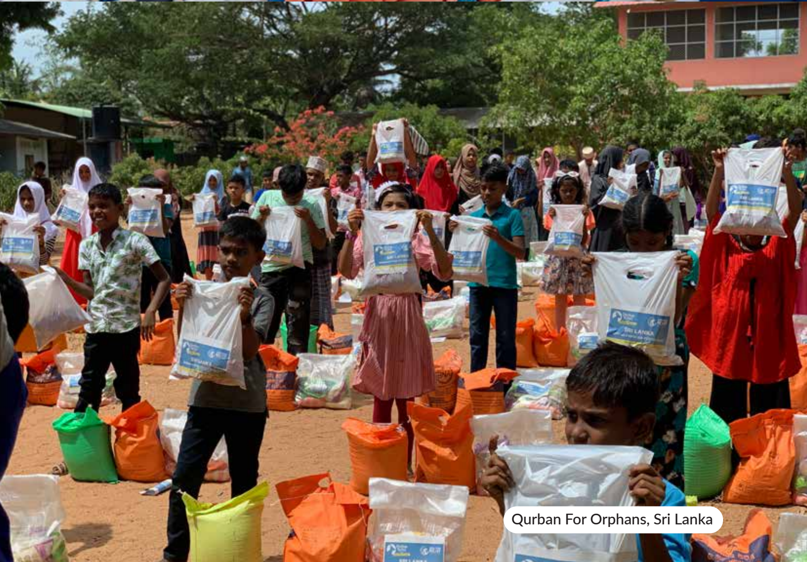
Qurban For Orphans, Sri Lanka