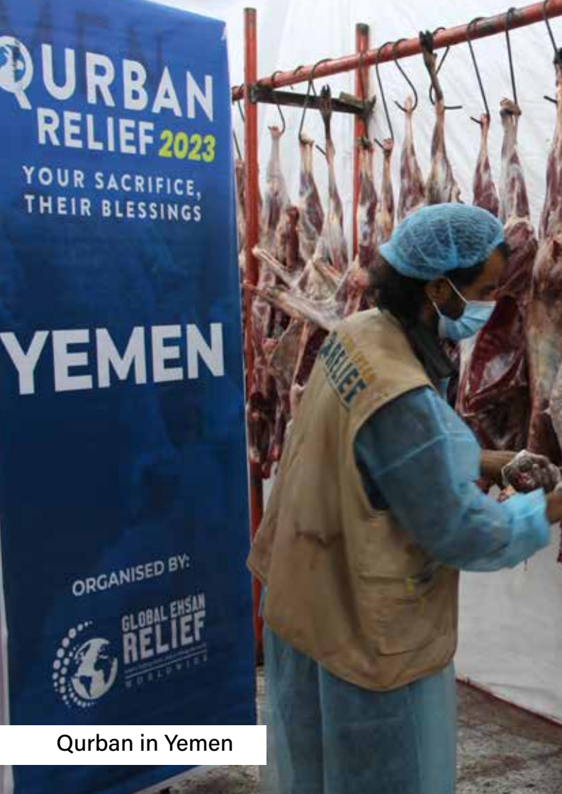
Qurban in Yemen