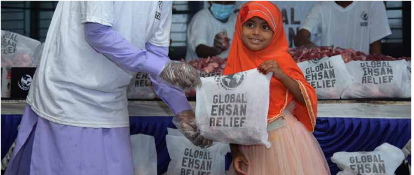
Qurban in Bangladesh (Rohingya Refugees)