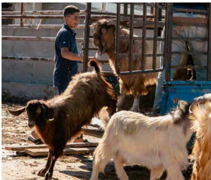
Qurban For Refugees in Lebanon