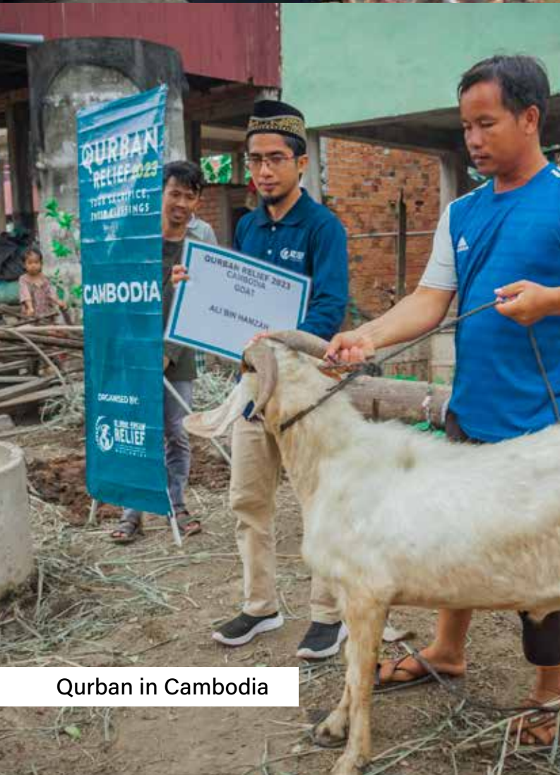
Qurban in Cambodia