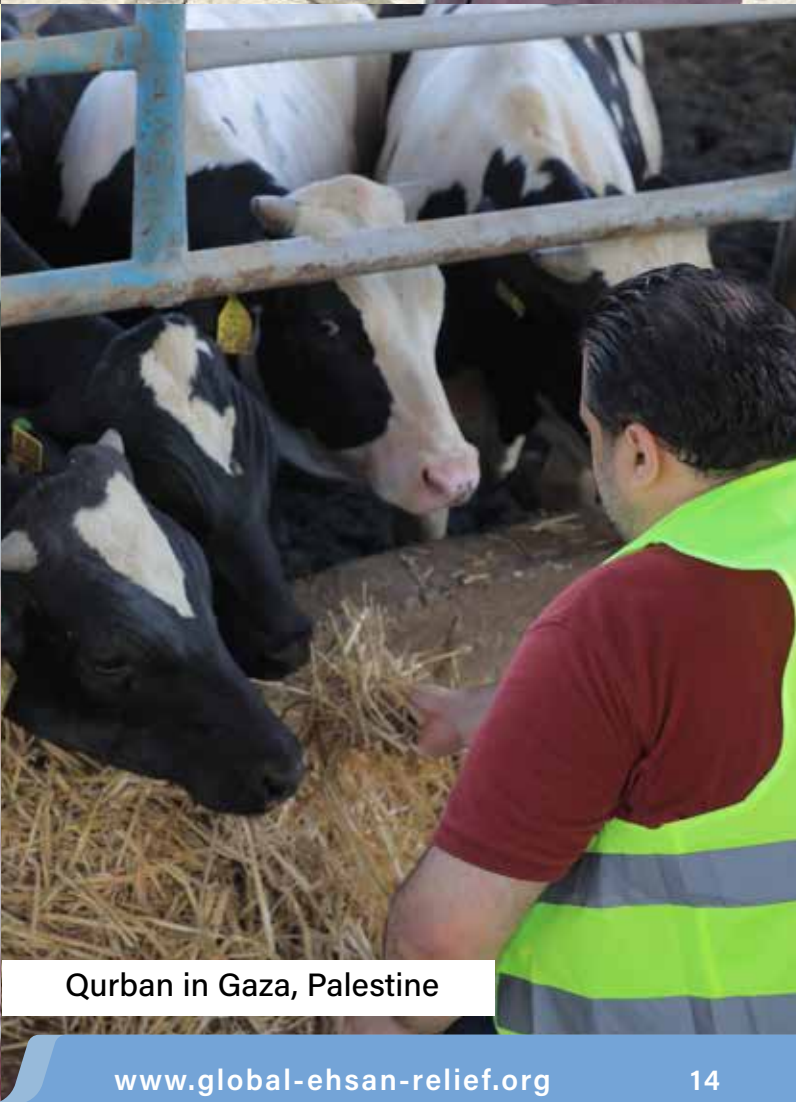
Qurban in Gaza, Palestine