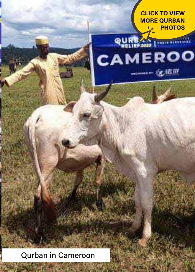
Qurban in Cameroon