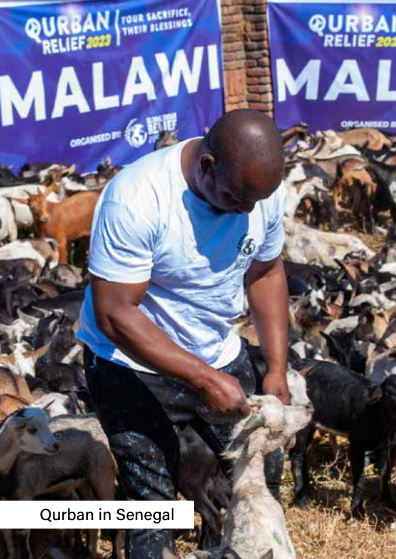
Qurban in Senegal