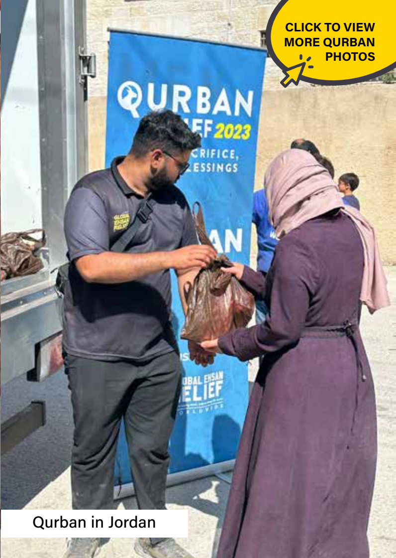
Qurban in Jordan