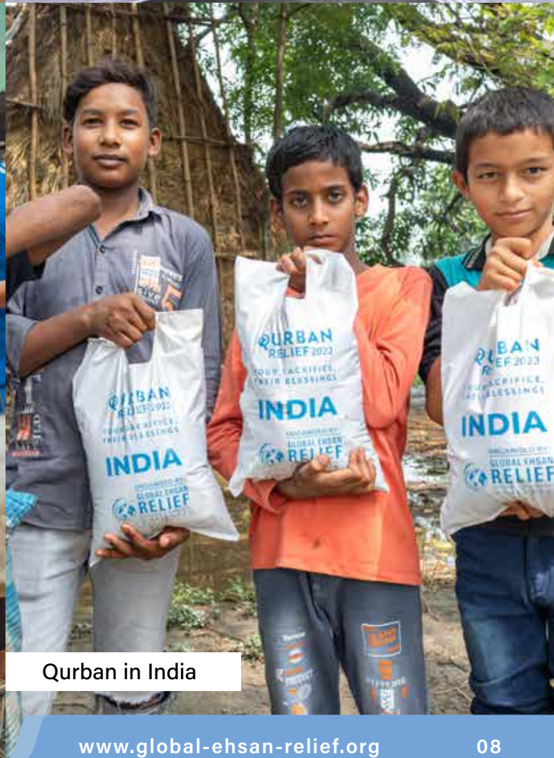
Qurban in India