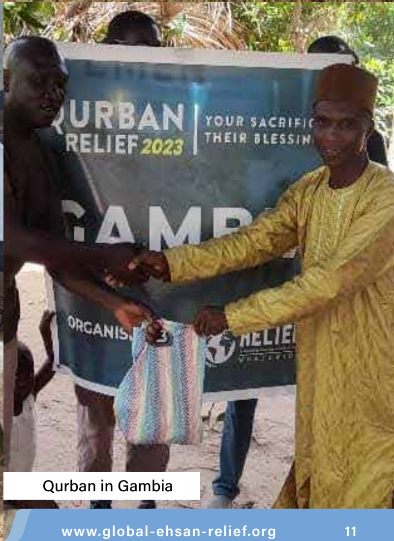
Qurban in Gambia