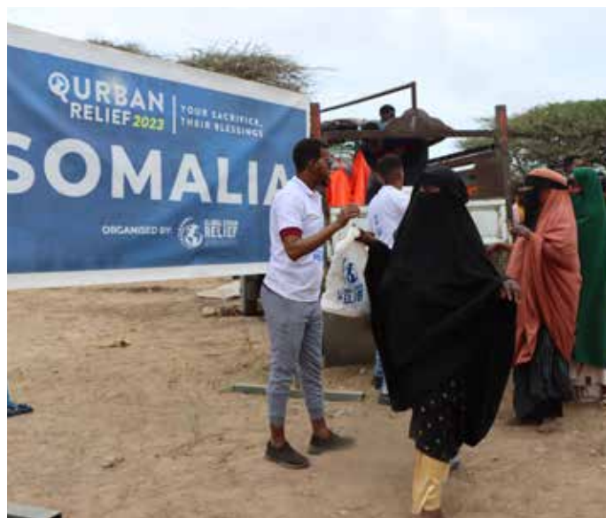
Qurban For Refugees in Somalia