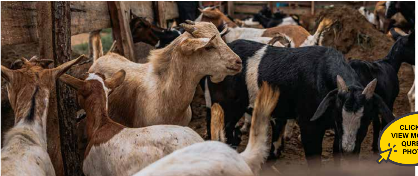
Qurban in Uganda