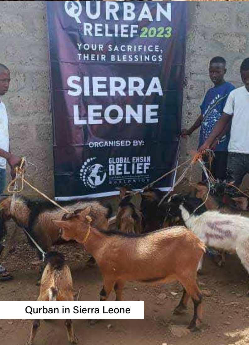
Qurban in Sierra Leone