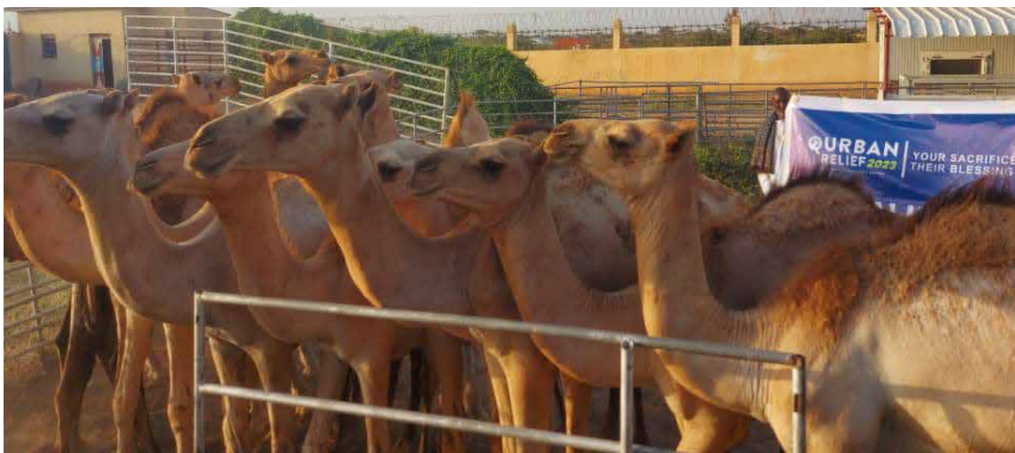
Qurban For Refugees in Somaliland