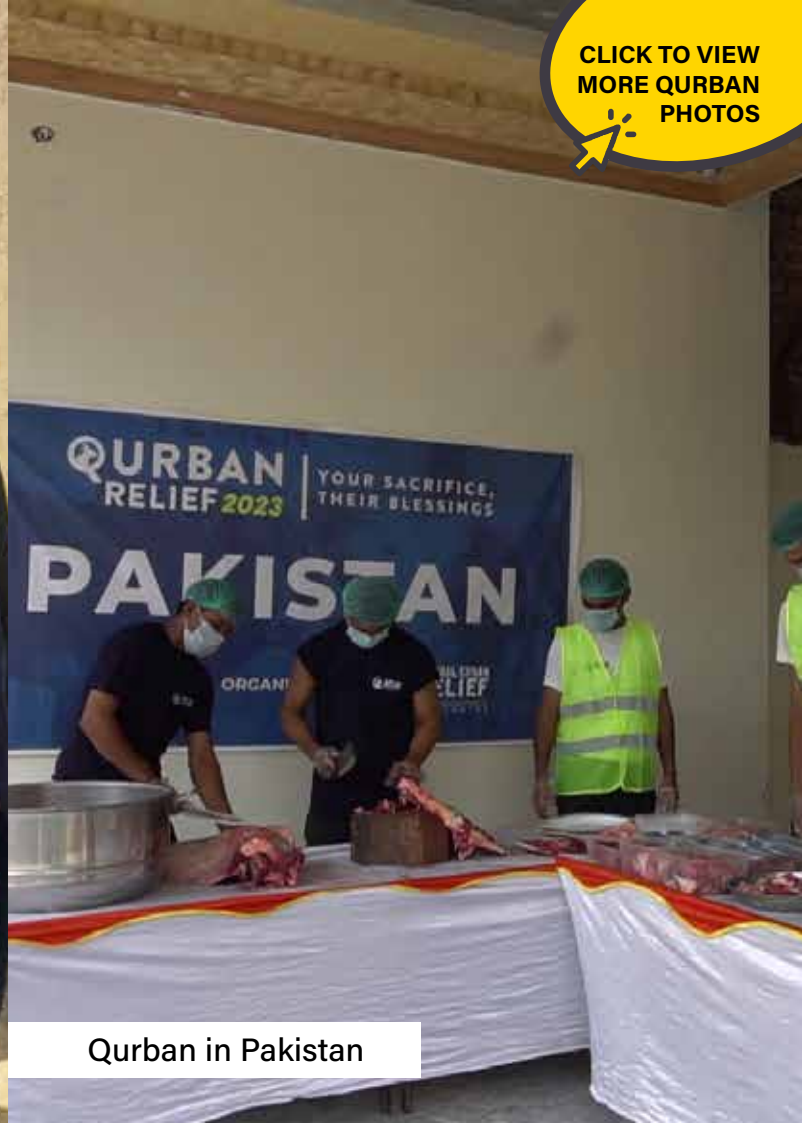
Qurban in Pakistan