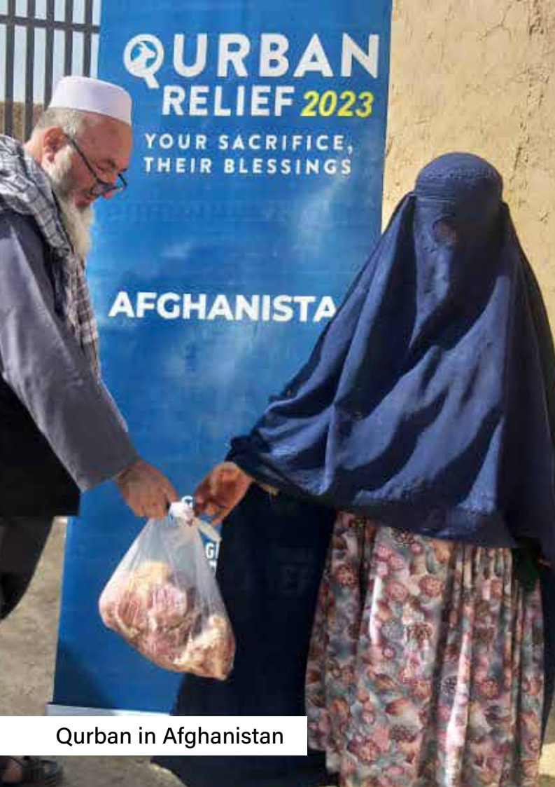
Qurban in Afghanistan