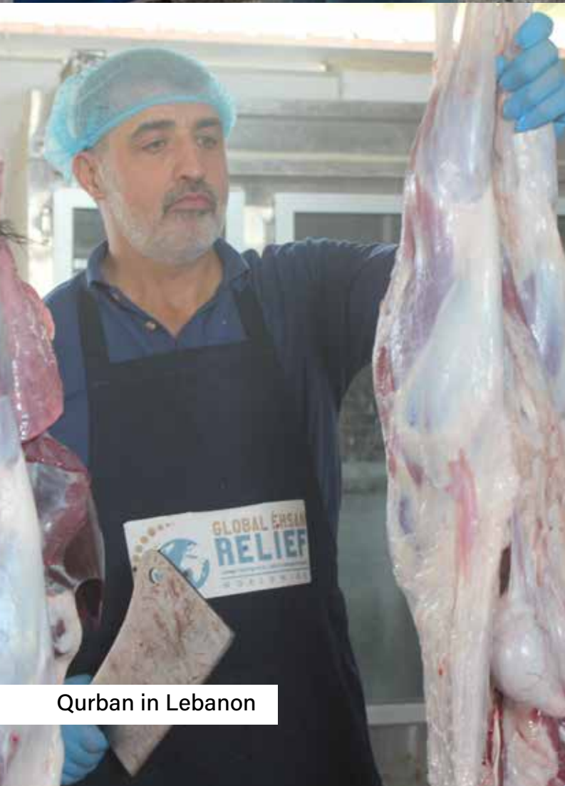
Qurban in Lebanon