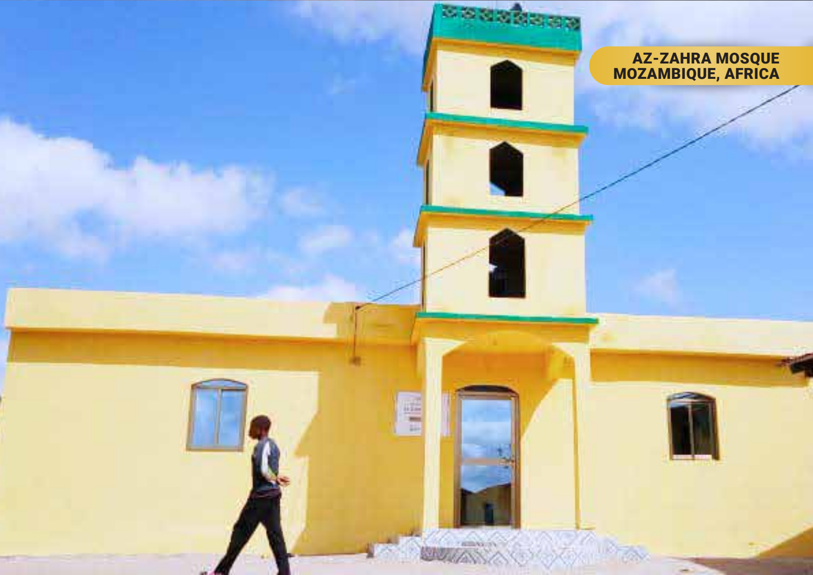
AZ-ZAHRA MOSQUE MOZAMBIQUE, AFRICA