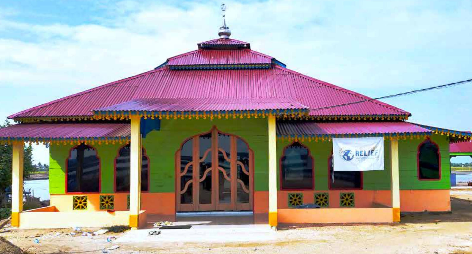
ELIS HAMDAN MOSQUE CAMBODIA