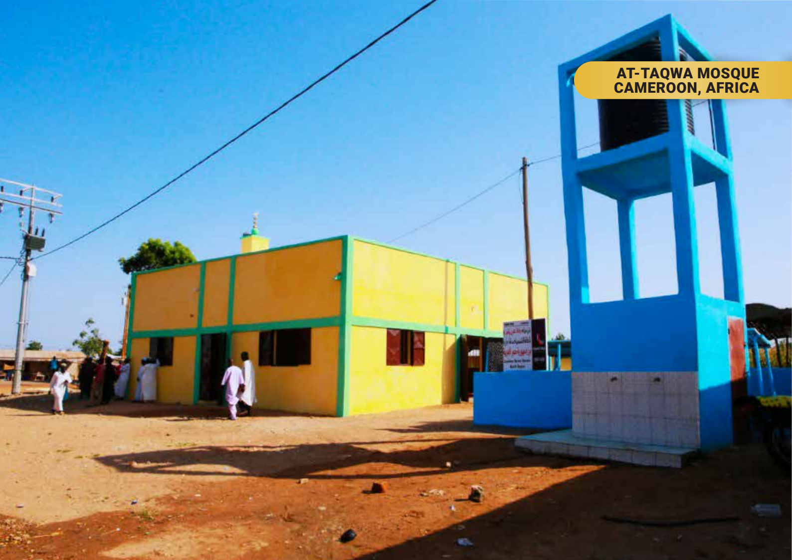
AT-TAQWA MOSQUE CAMEROON, AFRICA