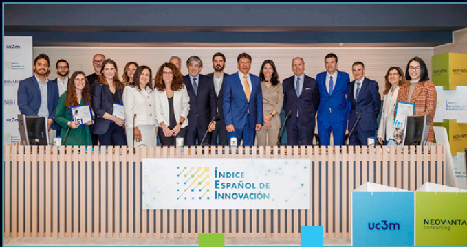
ÍEI 2023, group of award winners