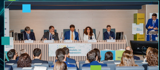
ÍEI 2023, presidential table