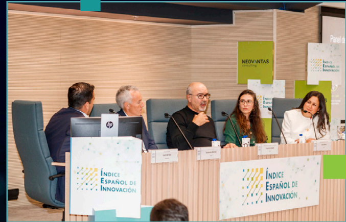
ÍEI 2023, panel of Spanish award winners