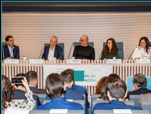
ÍEI 2023, panel of Spanish award winners