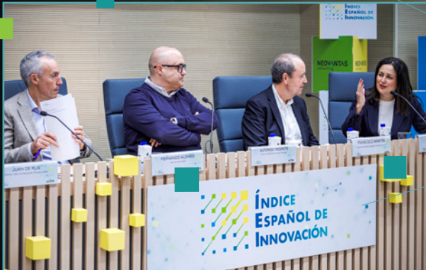
ÍEI 2024, panel of awarded companies: Balay, Ikea and Ouigo