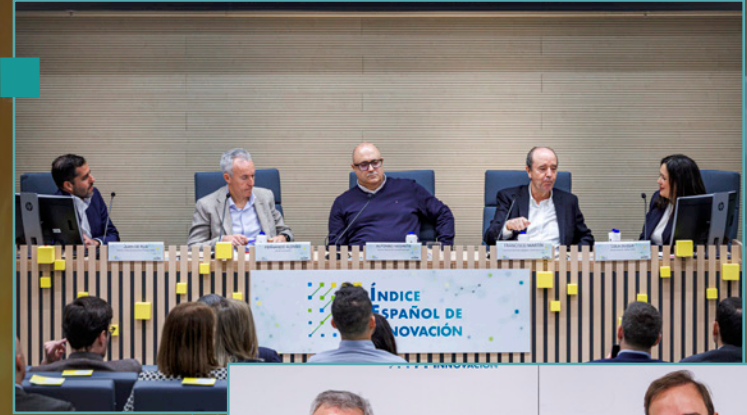
Award winners 2024 Global IIS: Toyota Spanish IIS: Balay Spanish IID: Cabify