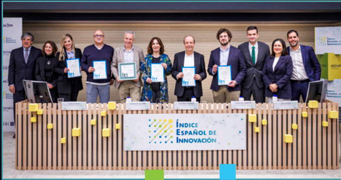
ÍEI 2024, group of award winners