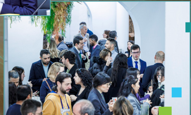
ÍEI 2024, coffee break