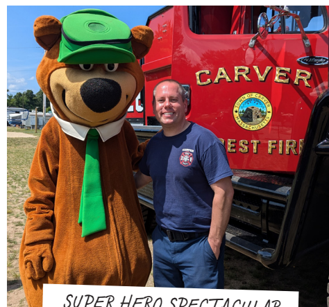
SUPER HERO SPECTACULAR