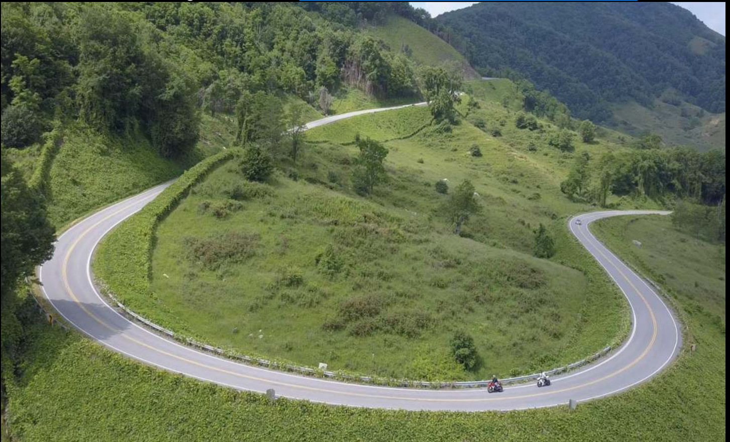
Figure 1 - Internet image / not from PCA or captured during a PCA event

Back of the Dragon on YouTube: https://www.youtube.com/watch?v=LOGZ-pwMIDM