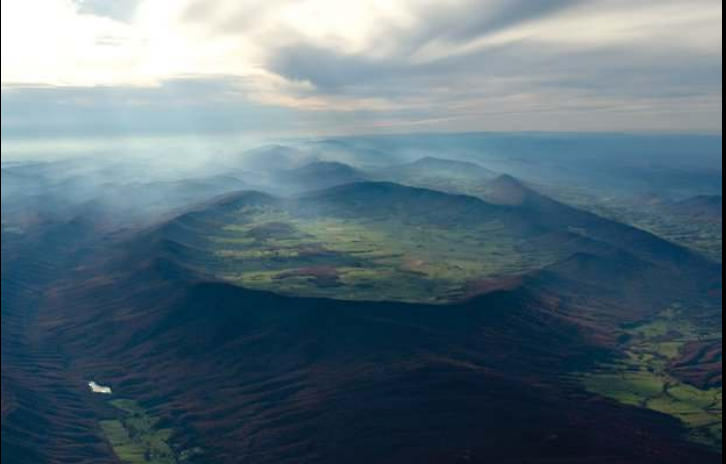
Figure 2 - Internet image. Not from PCA or captured during a PCA event

Burkes Garden on YouTube: https://www.youtube.com/watch?v=k07UpOLjyDc