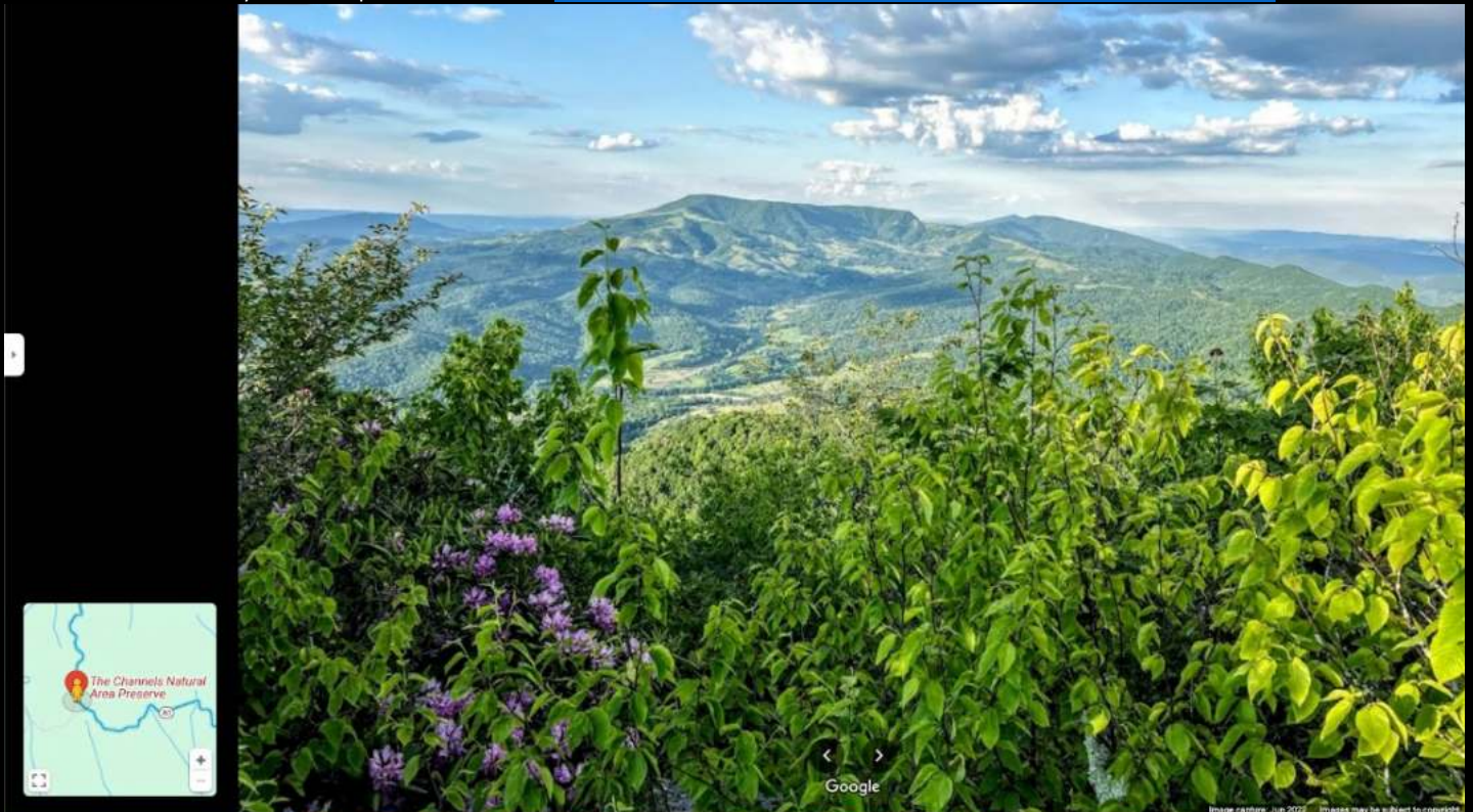
Figure 3 - Google Maps sourced image

Hayter's Gap on YouTube: https://youtu.be/wGy5D6BUi5o?si=E8wjQEdnoIO8sDIg