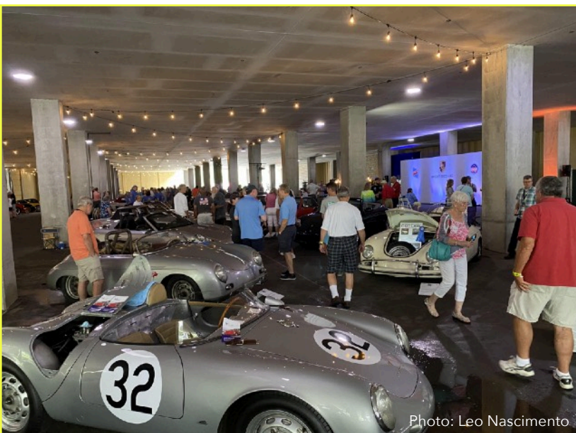
65th Porsche Parade - Historic Display

Join me in Birmingham for a celebration of Porsche excellence, camaraderie, and the thrilling lifestyle that comes with being a part of the PCA. Whether you're a longstanding member or new to the community, the Porsche Parade is an experience you won't want to miss!