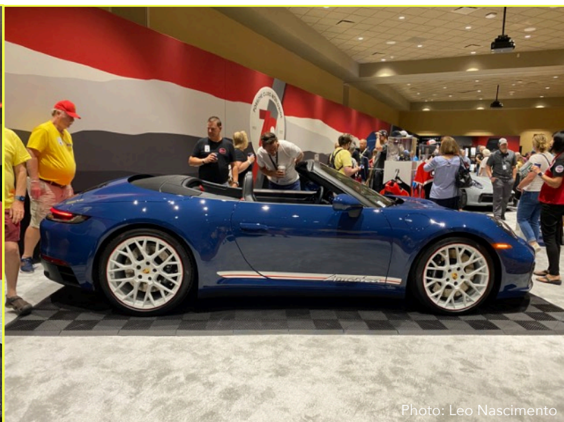
66th Porsche Parade - 911 Carrera GTS America Edition Wildnispfad - Vol 8 - Issue 04 - Jan / 2024