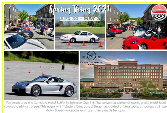
We've secured the Carnegie Hotel & SPA in Johnson City, TN. The venue has plenty of rooms and a multi-level covered parking garage. This event will include a Concours d'Elegance, guided driving tours, autocross at Bristol Motor Speedway, social events and an awards banquet.

30 (and May 1 st , May 2 nd ): PCA Smoky Mountain Spring Thing in Johnson City: Autocross at Bristol Motor Speedway, Concours d'Elegance and thrilling tour drives are some of the highlights of the weekend. Registration closes on April 14 th .