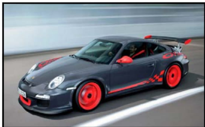
From PCA—New 2010 GT3-RS VERY AWESOME!!!!