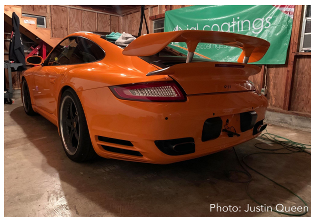
Tigger - Ceramic Coating job by Justin Queen

Full Body IGL Ceramic Coating - by Justin Queen @ Reflective Lab