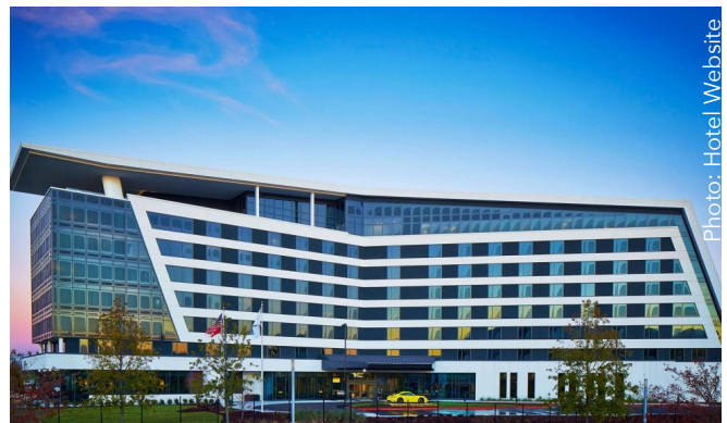
Kimpton Overland Hotel (top) / Porsche decoration at the Hotel (bottom)