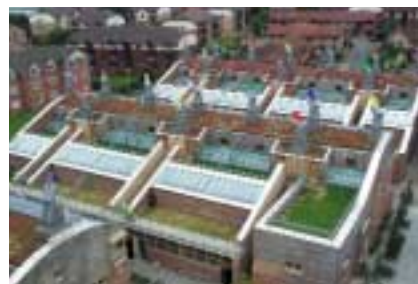
Most of the homes have access to a private garden. There is great potential for the biodiversity of a site to be increased particularly with the use of local flora and fauna