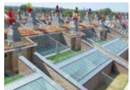
Using porous materials on roofs should also be encouraged. The sedum roofs specified absorb some of the rainwater and help reduce the speed of run-off