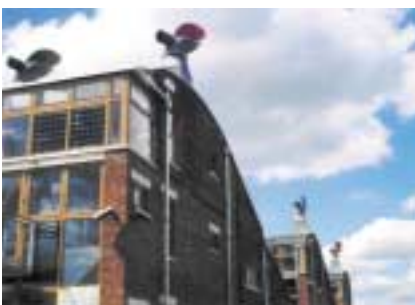
BedZED comprises 82 homes, office space and live-work units. It is the UK's largest eco-village.

housing stock), housing at least twice that number people. If investment levels are maintained and the transfer of former local authority stock continues, housing associations will own and manage around 4 million homes in 10 years time. This would make the sector the largest provider of social housing in England. Housing associations are already the largest provider of new social housing.