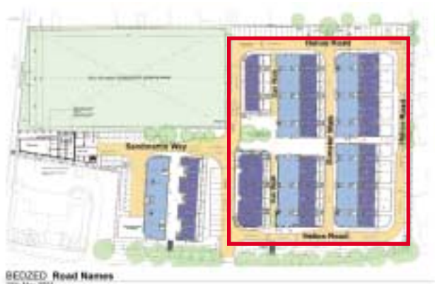
The development achieves an overall density of 47 homes/hectare. The BedZED core (ZED model) highlighted in red, achieves 100 homes/hectare

On site, units have been earmarked to accommodate a childcare facility and a doctor's surgery. Communal space is provided by a sports pitch with clubhouse and a multi-purpose space which currently houses the BedZED exhibition and is regularly used for community events. A village square with native trees and seating lies at the heart of the development, forming part of the pedestrian route through the site.