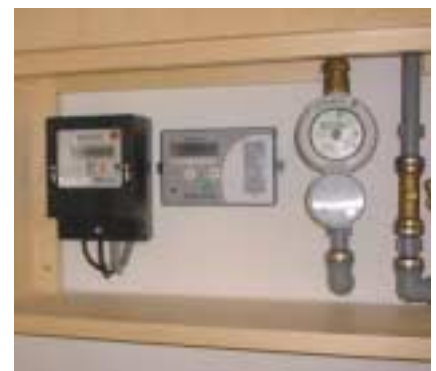
Visible utility meters in the kitchens allow residents to monitor their performance and encourage reduced energy and water use