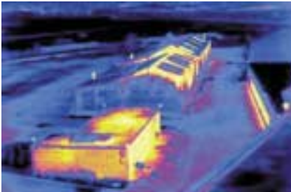
Investment in energy efficient homes helps to reduce fuel poverty by cutting running costs for tenants