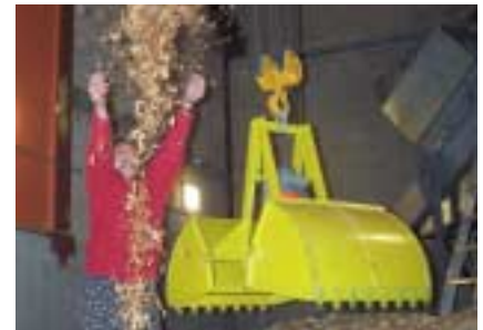
The Combined Heat and Power (CHP) plant runs on chipped tree surgery waste which would otherwise be sent to landfill

By combining water recycling and conservation strategies with specifying water efficient fittings and appliances such as washing machines, spray taps, showers and dual-flush low-flush toilets, reductions in mains water usage of 40% are achieved. Such appliances may have higher initial costs, but save on the consumption of metered water. Follow-up advice on reducing water use is expected to see residents cutting their water consumption by up to 50%. A typical household could save £48, an enthusiastic household could save up to £106 per annum.