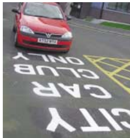
At least 3 car club members at BedZED have sold their cars since joining the club.

Advantage has been taken of all planting opportunities around the site. The village square, the roof garden planters and all site landscaping has favoured native plants and is designed to encourage wildlife. Private gardens are provided to 71 of the 82 units. These are an average size of 16m 2 and are predominantly roof gardens located on top of workspaces. Uninhabitable roofs are finished in a sedum green roof system.