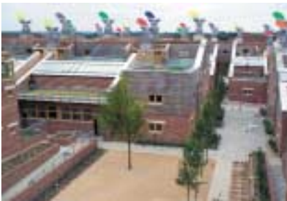
The village square at BedZED. A place for chance meetings and social interaction on the mixed-use, mixed-tenure development