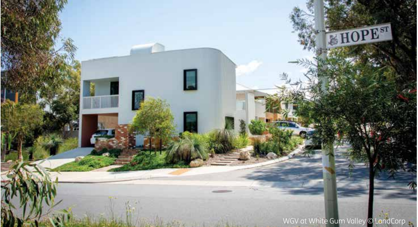
WGV at White Gum Valley