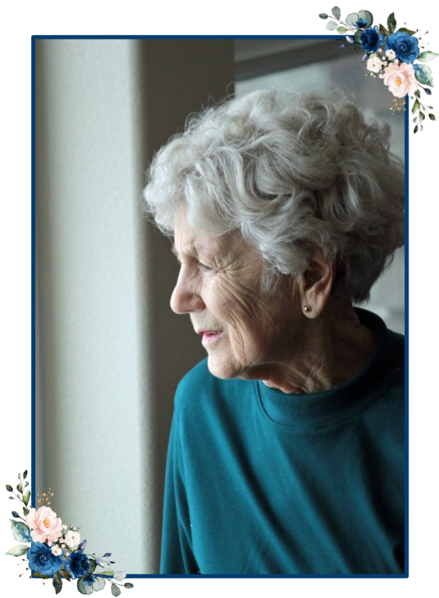
"I love you dearly"