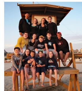
Grandkids, the beach, 2014