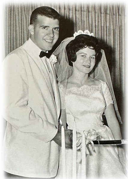
Married July 22, 1961