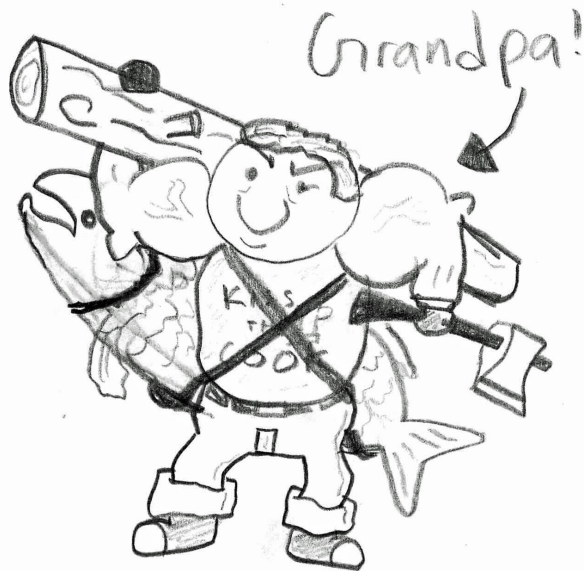
By Jaiden Castleton