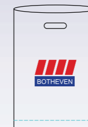
Cold / Heat Punch