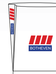
Twist Gusset Bag