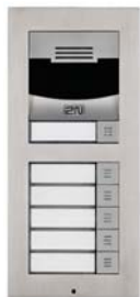
2N® Helios IP Verso