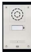
2N® Helios IP Uni

The 2N® Helios IP family is a wide range of door intercoms for every situation - whether in security, business, emergency, or any other special area.