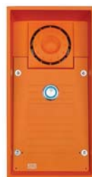
2N® Helios IP Safety