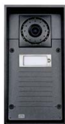
2N® Helios IP Force