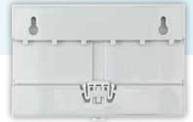
Wall-mounting bracket or on DIN rail