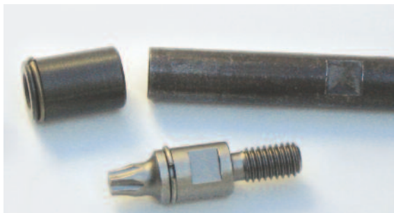
Hand Drill with Extended TORX® Bit Compatible with any 18V power drill.

Dekfast ISO-TAK does not require special equipment in order to install insulation or single-ply membrane, however SFS intec has designed ergonomic setting tools and accessories designed to facilitate installation.