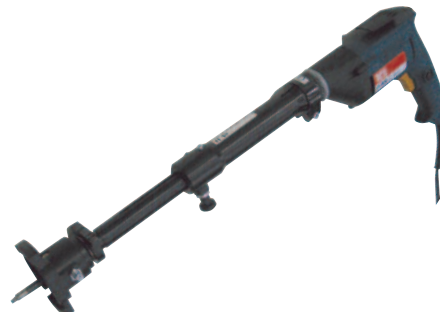
IT-18 Hand Setting Tool Provides fast, easy and consistent installation.