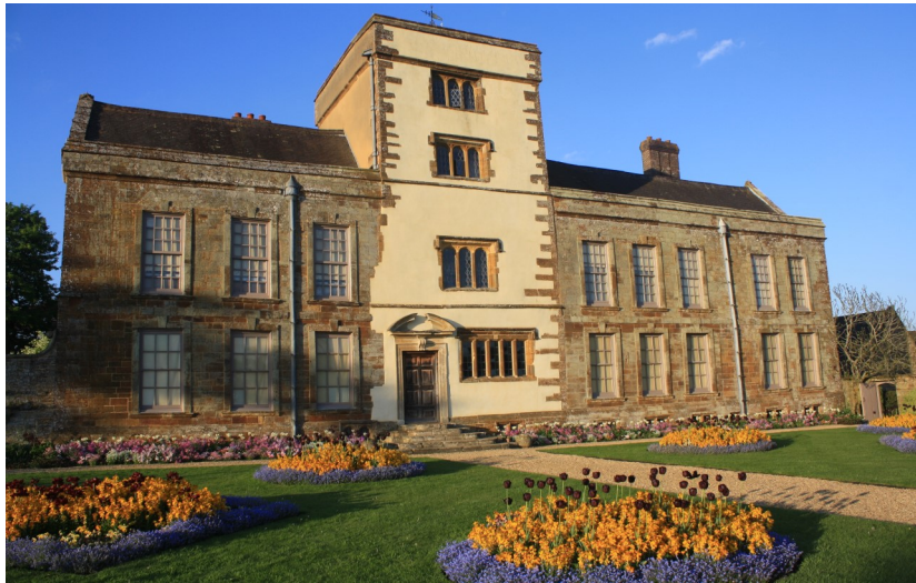
Canons Ashby House (see page 3)