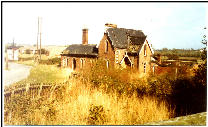
Finedon station prior to demolition c. 1980. The station had closed to all traffic in 1964