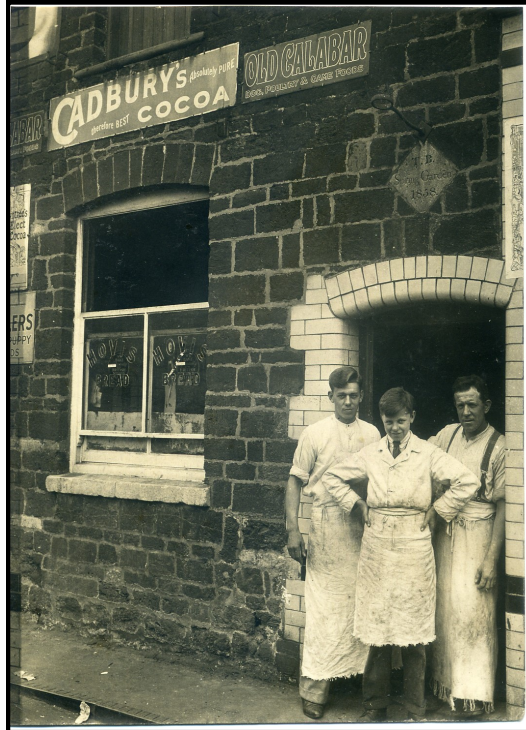
Warner 's Bakery in High Street