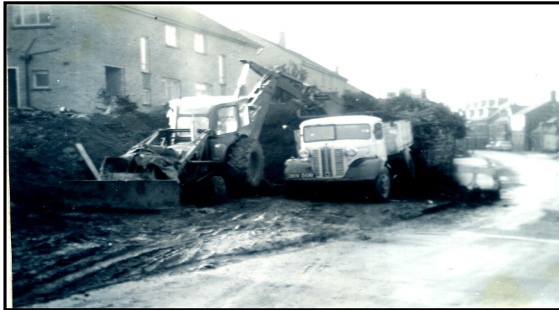
Demolition of the wall of Whitlark' s garden, Well Street. 16 May 1958. Whitlark ' s house stood opposite Waterlow Bridge. Several skeletons were found during the demolition. Early owners were a Quaker family who followed the practice of burial in their own garden.