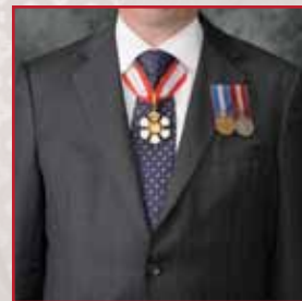
Neck badge and medal bar