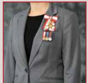
Neck badge on bow and miniatures