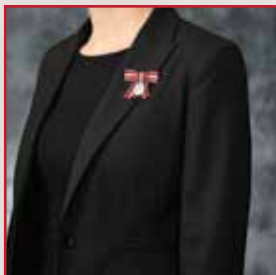
Single miniature on bow