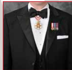
Neck badge and miniatures

Note: the same rules apply to White Tie and Tails.