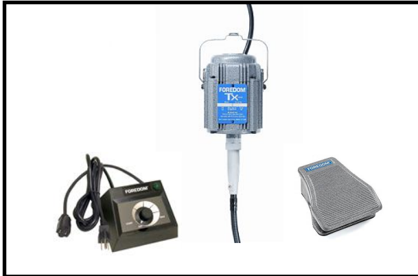
Foredom Motors & Foot Controls