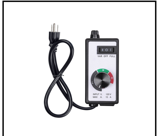
Manual Control for any motor

Note: Foredom handpiece attachments and other cable driven handpieces are also available