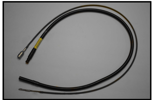
Flexible Shafts & Sheaths for Foredom brand motors