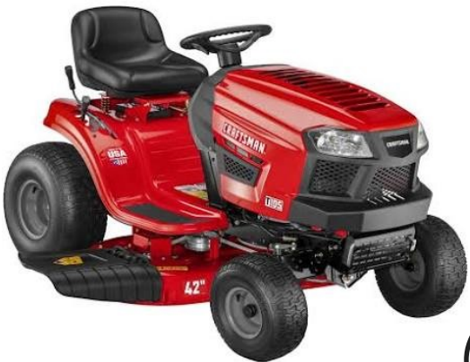
Craftsman 17.5HP 42" Riding Lawn Mower