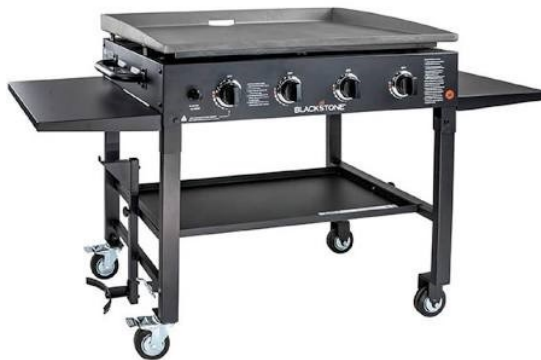
Blackstone 36" Flat Top Outdoor Griddle