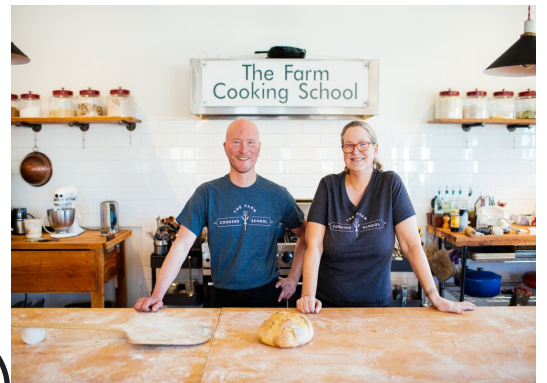
Set of (4) Classes Farm Cooking School in Lambertville