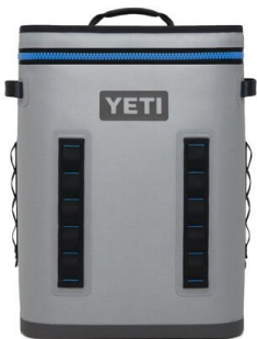
Yeti Hopper BackFlip 24 Backpack Cooler