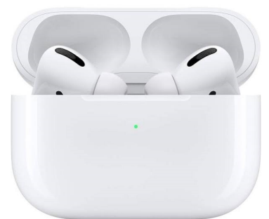
Apple AirPods Pro