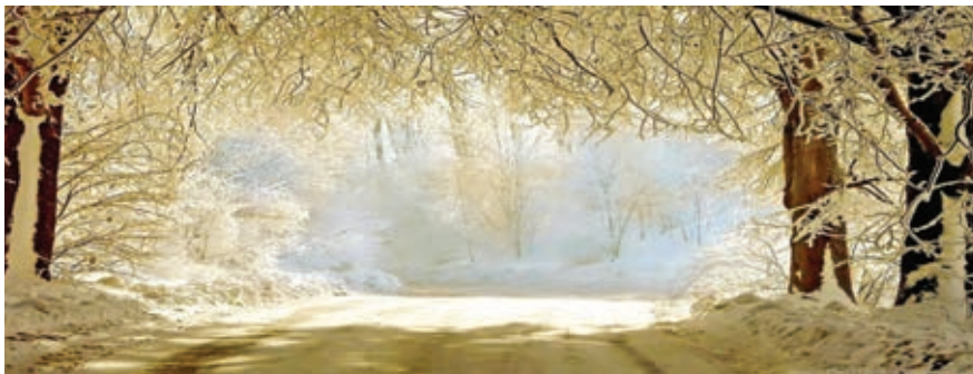
What lies ahead?