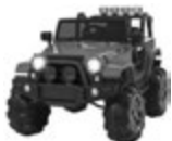
4th Prize 12V Ride on Car, Jeep with Parent Control, SUV