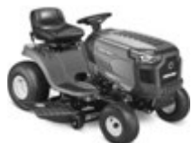
1st Prize Riding Lawn Mower