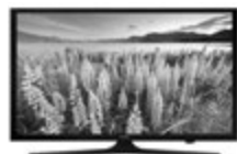
3rd Prize 50" LED Smart TV

DON'T YOU KNOW SOMEONE WHO WOULD WANT TO TAKE ONE OF THESE FABULOUS FIVE ITEMS HOME?