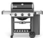
2nd Prize Weber Grill