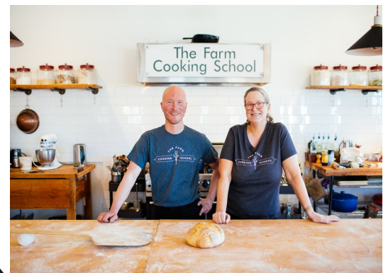
Set of (4) Classes Farm Cooking School in Lambertville