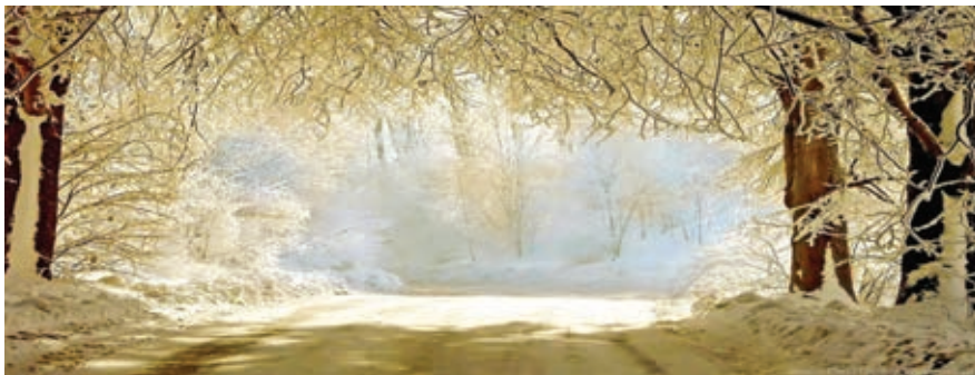
What lies ahead?