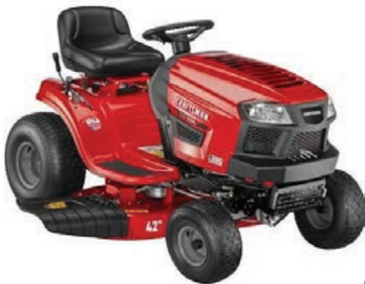
Craftsman 17.5HP 42" Riding Lawn Mower

Drop your tickets off at the office this week!