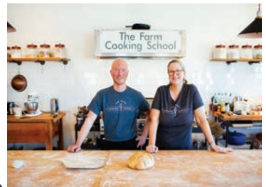
Set of (4) Classes Farm Cooking School in Lambertville