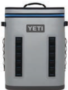
Yeti Hopper BackFlip 24 Backpack Cooler