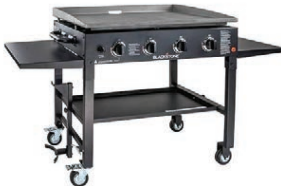
Blackstone 36" Flat Top Outdoor Griddle