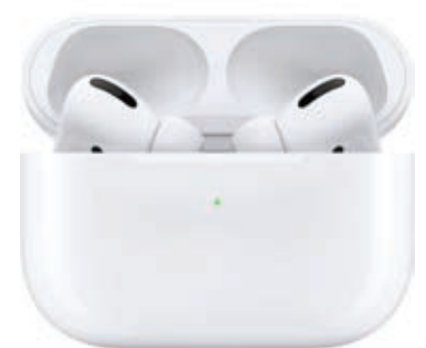
Apple AirPods Pro