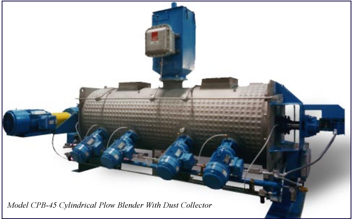
Model CPB-45 Cylindrical Plow Blender With Dust Collector