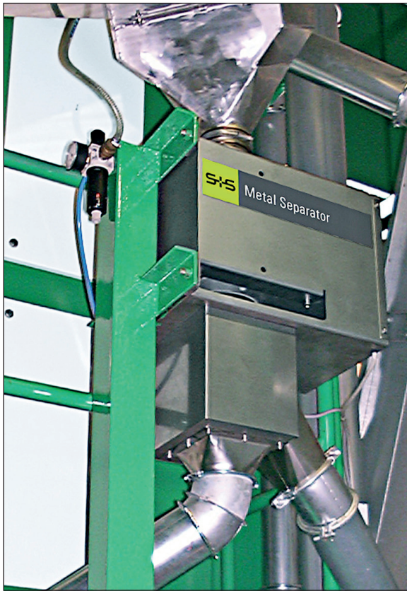
Metal separator RAPID 4000 used for quality control at a filling station for dried vegetable.