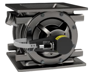
Shaft Zero Speed Switch